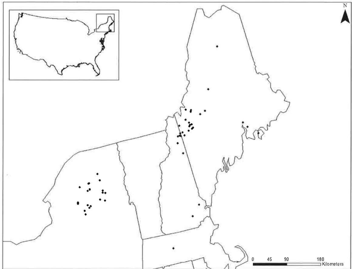
Figure 2. Location of study area and lakes where Common Loon nests were monitored during the 1994-2011 breeding season.