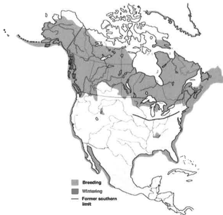
Figure 1. Common Loon breeding and wintering range in North America (Evers et al. 2010).

Numerous factors have been found to affect Common Loon breeding success. Loons have been shown to be negatively affected by human disturbance, but most studies have shown little to no effect on breeding success attributed to human caused disturbance (McIntyre 1975, McIntyre 1988, Titus and VanDruff 1981, Caron and Robinson 1994, Badzinski and Timmermans 2006). Lakes with more cottages have a lower probability of loon nest success, but once hatched, chick fledging is independent of human recreational activities (Heimberger et al. 1983, DeSorbo et al. 2006). One study even showed an increase in the number of chicks fledged on lakes with more intensive development (McIntyre 1988). Human development can also affect loons by