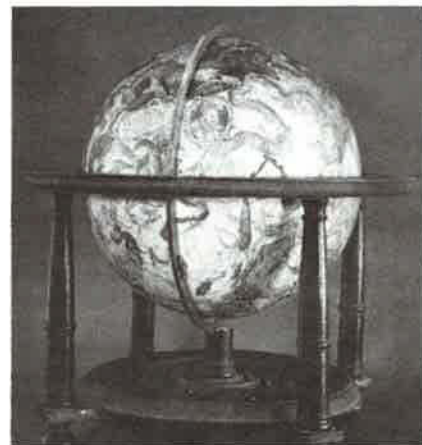
A globe from USM's Smith Collection.

atlases, and the Harold L. and Peggy L. Osher Map Collection, prompted the Maine Humanities Council to mount "The Land of Norumbega" project in 1988 and early 1989. "The