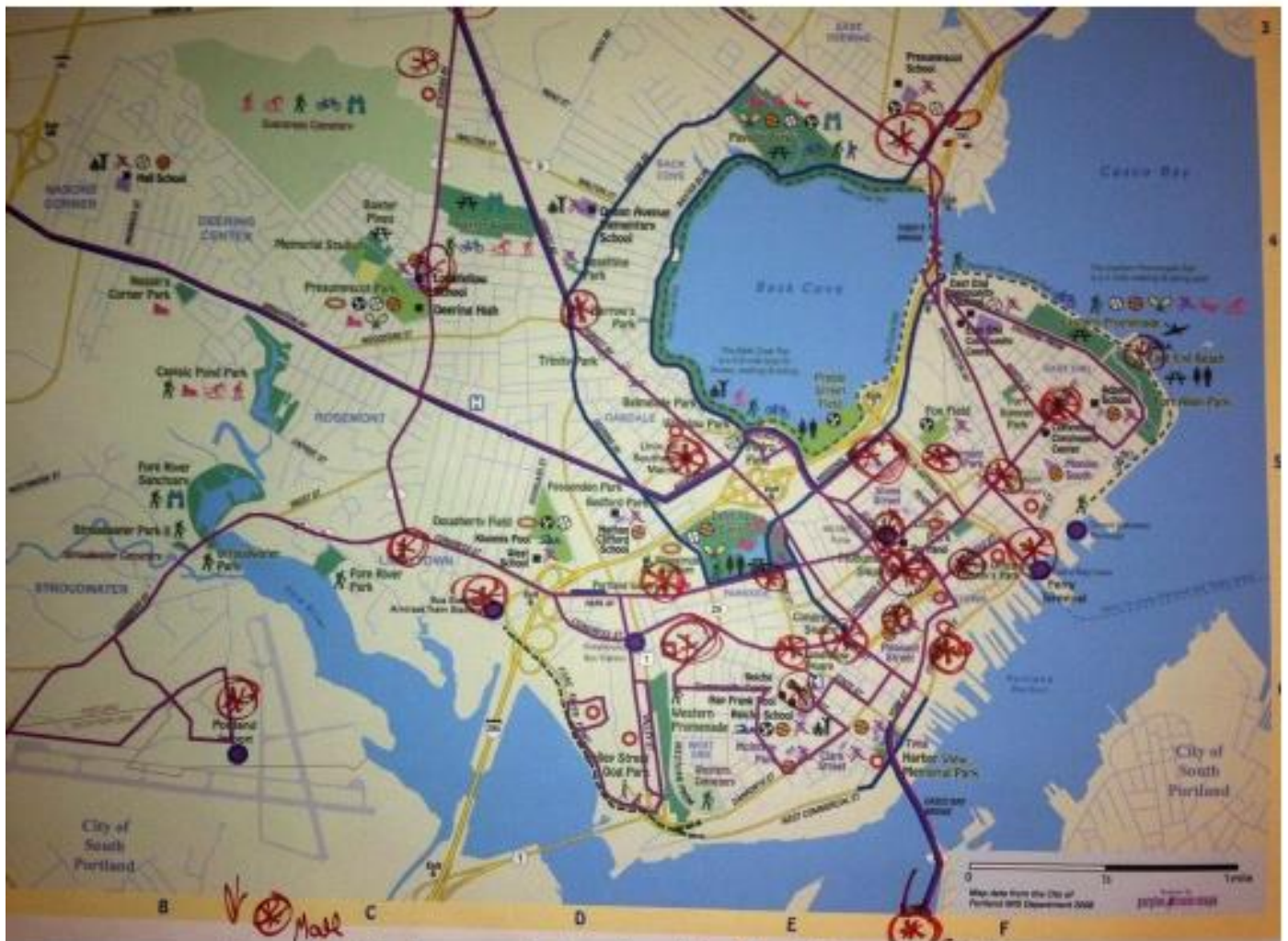
Figure 4: Site locations determined at EPA workshop in 2013.

share stations. The recommendations found in the literature show that increasing access and density of stations has been found to increase the success of bike shares. The recommendation is to follow this guidance, and not only place stations throughout all neighborhoods of Portland, but to also have a high density of stations. The current recommendations for siting are that the City has at least two fully operational kiosks; where credit cards can be swiped and /or cash can be paid in order to access the bicycle rentals, as well as stations located in various parts of the City that make the program accessible to all Portland residents and visitors. The US Environmental Protection Agency (EPA) selected Portland for study for a potential Bikes Share program in 2013 (EPA (b), 2013). As part of this study, sites were selected by citizens and City staff). These sites are located in the most densely settled areas of Portland, and include a variety of locations representative of Portland’s diverse neighborhoods.