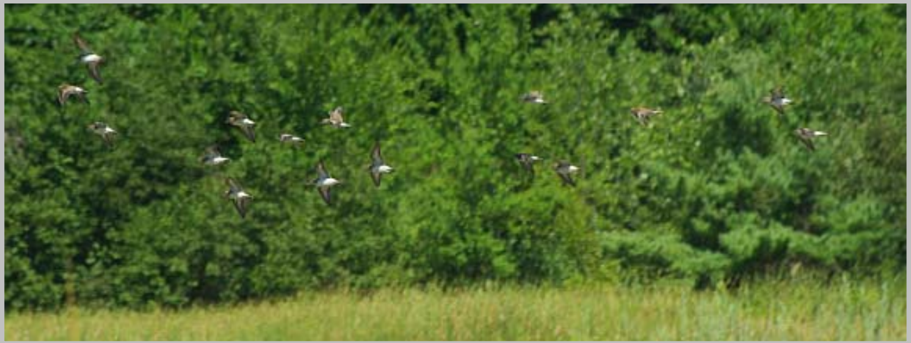
Roosting Least Sandpipers ( Calidris minutilla ), Royal River marshes, Casco Bay.