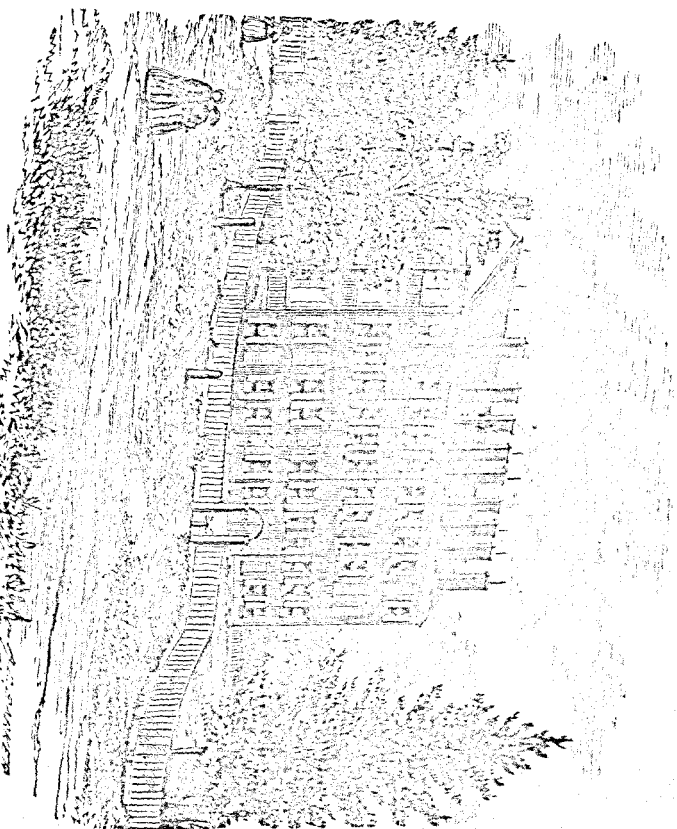
Normal School Boarding Hall, Gorham.