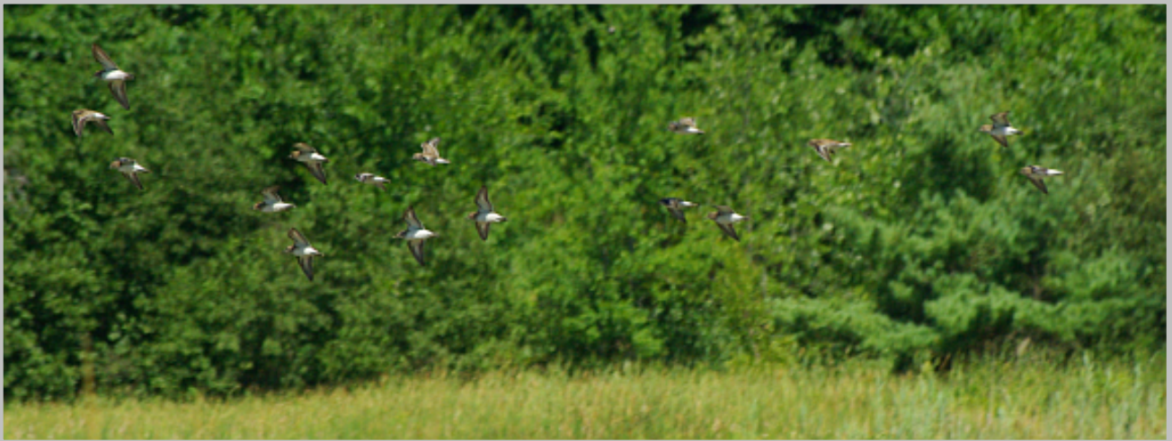
Roosting Least Sandpipers ( Calidris minutilla ), Royal River marshes, Casco Bay.