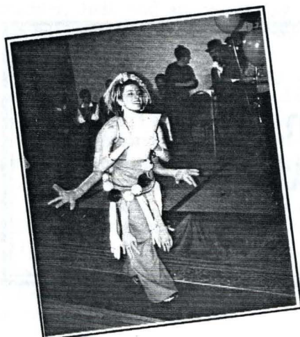
Pumpkin Ball Memories

6th Annual Great Pumpkin Ball Saturday, October 26 8:00 pm Eastland Park Hotel 157 High Street Portland