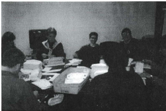
Volunteers are the heart and soul of MLGPA's activities. Here a group stuffs envelopes for a recent fundraising mailing.

Two years ago Maine was to become the first state in the nation to launch a pioneering new program that included a federal waiver to pay for early medical care for about 300 people with HIV who were ineligible for Medicaid because of their incomes.