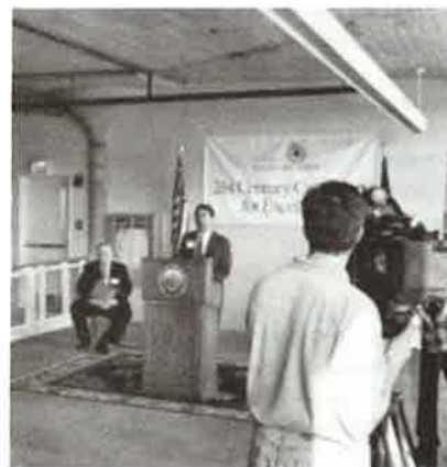
The Campaign was announced at a news conference on Feb. 1, 2000.