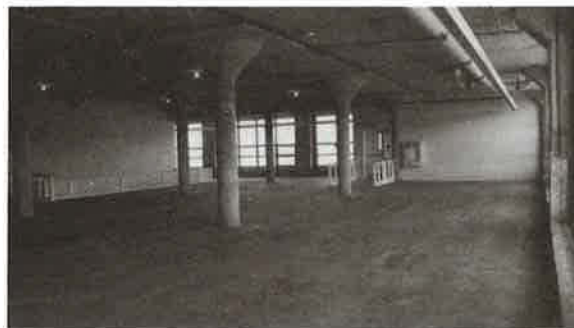
BEFORE: 7th floor of USM's Glickman Family Library at the start of the Campaign

AFTER: Architect's rendering of the completed 7th floor. The reading room is made possible by UNUMProvident Corp.