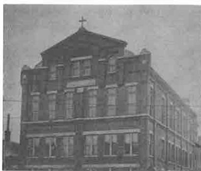
A sample from the collection: "The Dominican Block," Lincoln & Chestnut Sts., Lewiston. Built in 1881, the Block served as a school as well as a social and political center for the French Catholic population.

In early February, several programs were presented ranging from "Religion and the refugee experience" to "Being (perceived as) a religious radical," to "Spirituality, political action, and self development," to "Scripture as a springboard for contemporary standards," to "The collusion of religion and racism in violence against women."