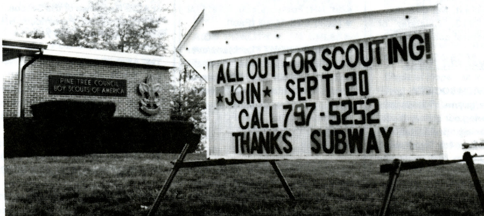
Pine Tree Council of Maine "Recruits"