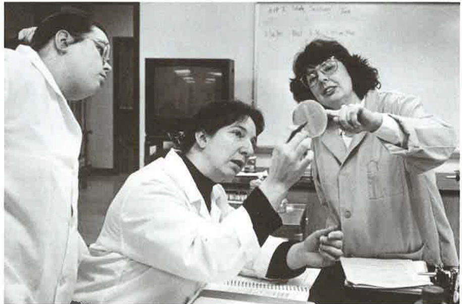
Students work in a microbiology lab at Lewiston-Auburn College. L-A College celebrates its 10th anniversary on the afternoon of Sunday, October 25. Members of the university community, alumni and friends of the college are invited to the event-filled gala, which includes food, art exhibit, music, poetry readings, faculty and student demonstrations, and story telling, from 12:30 to 3 p.m., followed by a ceremony from 3 to 4 p.m. with Governor King, public and university officials. For more information, call 753-6500.