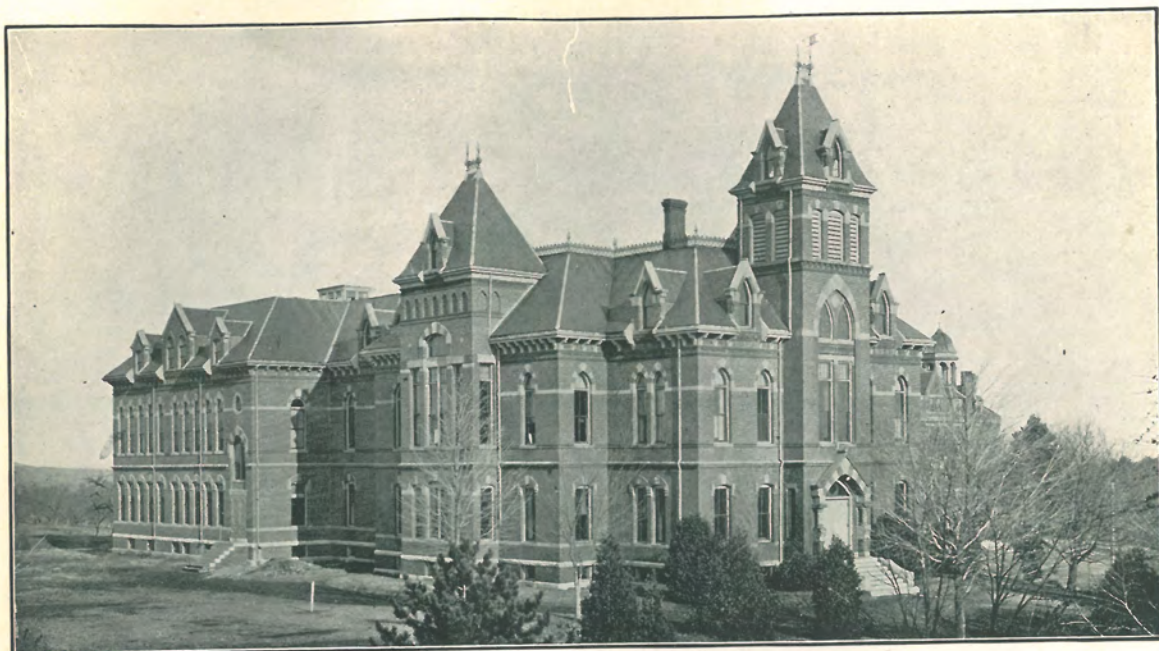
RECITATION BUILDING, GORHAM NORMAL SCHOOL