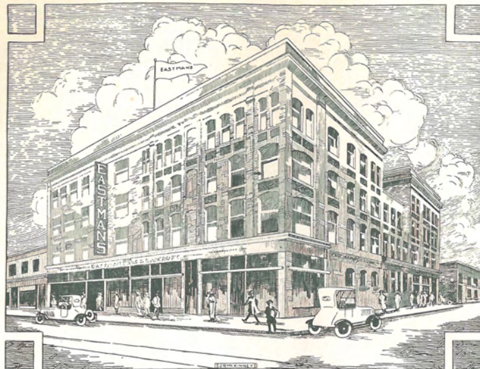
EASTMAN BROS. & BANCROFT "Maine's Leading Dry Goods Department Store" PORTLAND, MAINE