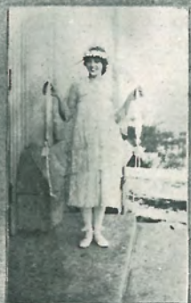
THE EASTER BONNET