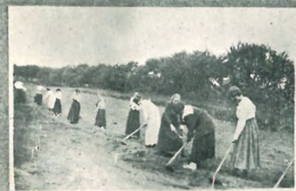
AN ANNUAL EVENT