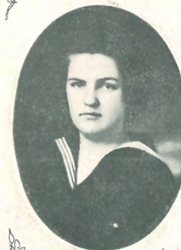
Dead KATHE Po "The Superv File Go