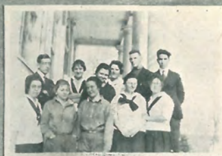
MANUAL TRAINING CLASS.