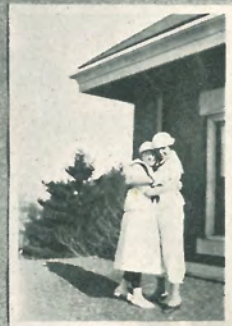
A PRESSING ENGAGEMENT.