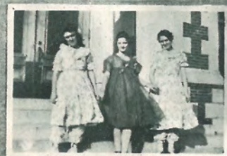
ON WITH THE DANCE.