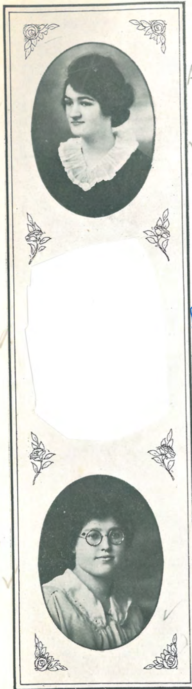
VERA AVERELL MOORE