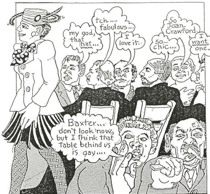
After The Awards Ceremony...

HIV + Support Group meets from 5:30-7:00 P.M. at The AIDS Project, 22 Monument Square, Fifth Floor, Portland.