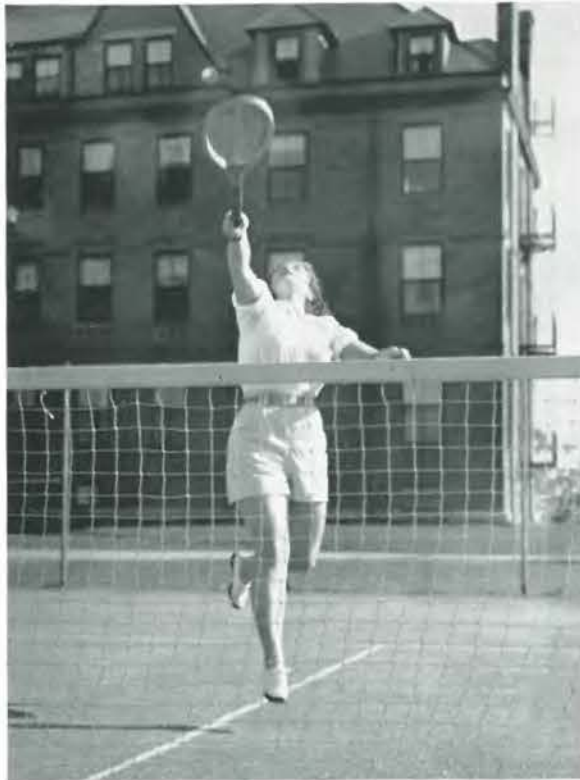
Reaching for a High One