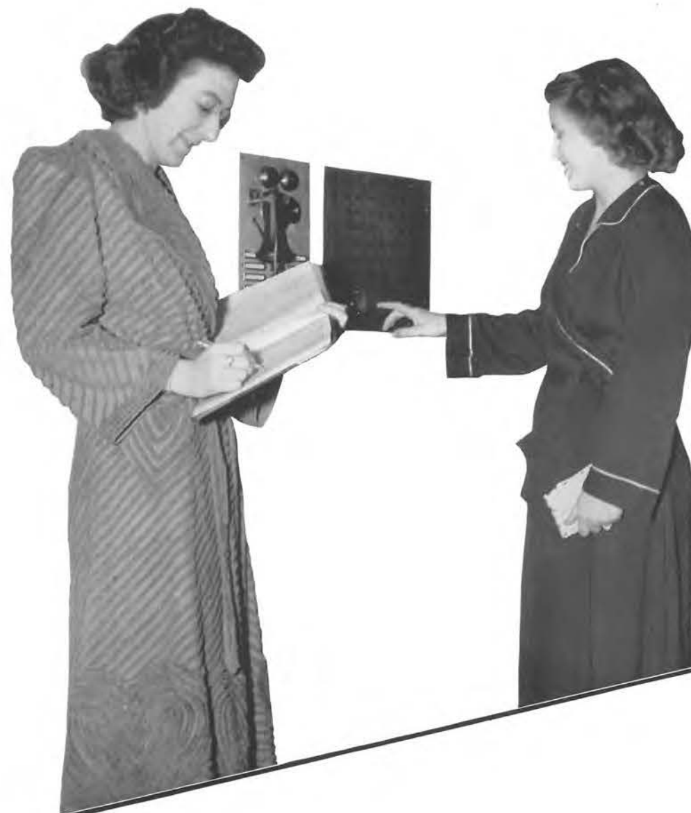
10:15 Bell and All's Well