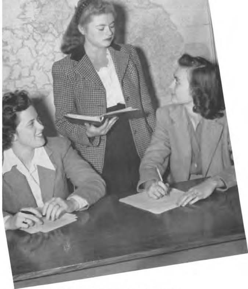
Civic Council Allocates Activity Funds