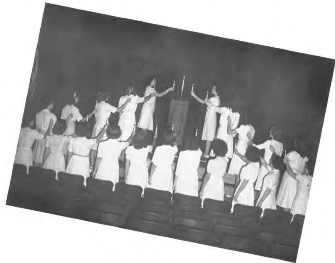
New Members Inducted in Candle Lighting Service