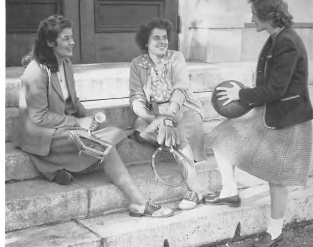
Will It Be a Bull's Eye?