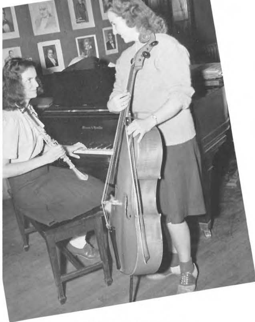
Instrumentalists Tune Up For Rehearsal