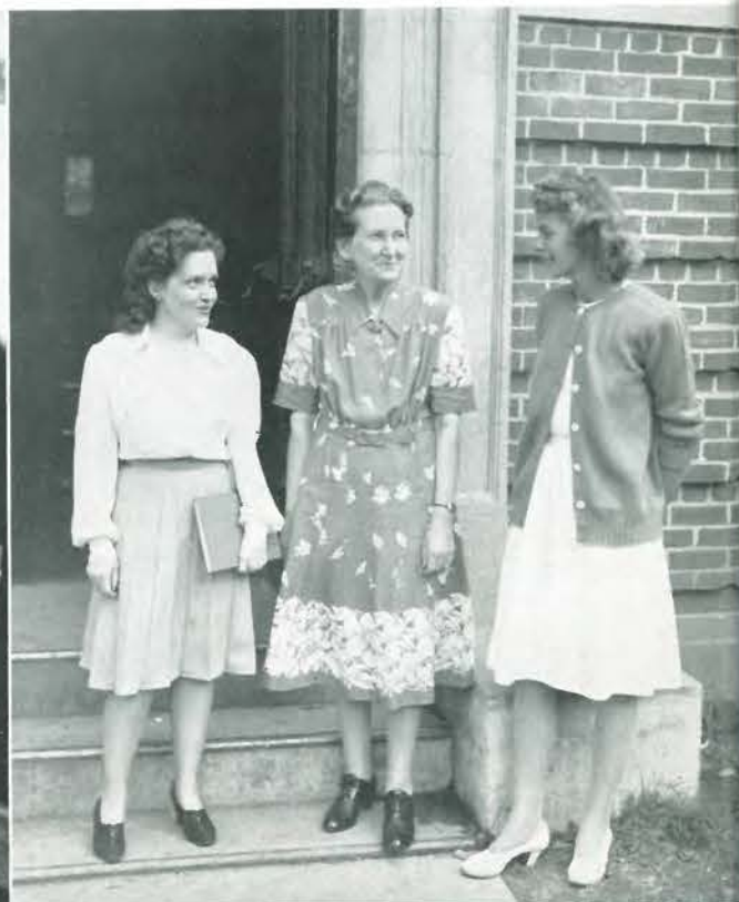
Primary Grades Are Their Specialty