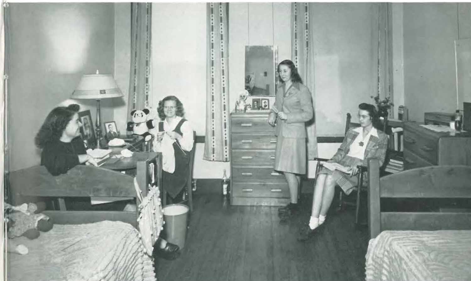
Classmates Drop In On Em and Betty to Catch Up on Campus Chitchat