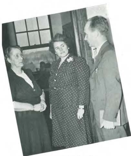
Junior High Staff