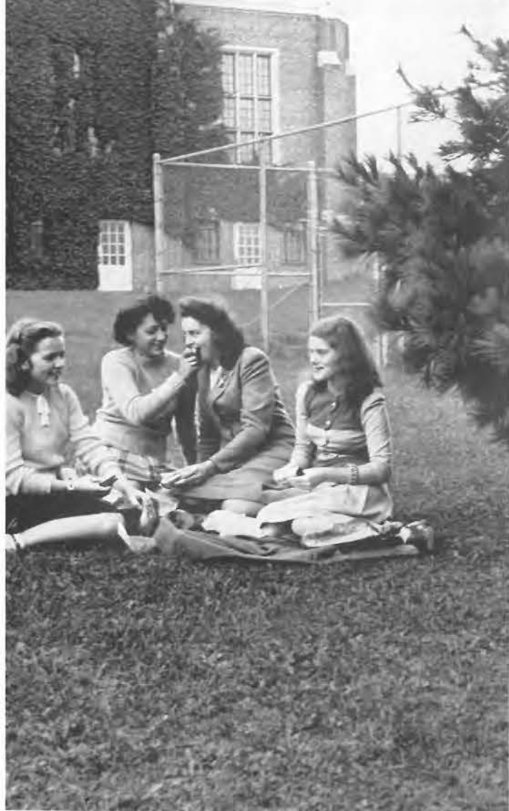
Commuters Find Pleasant Spot for Lunch