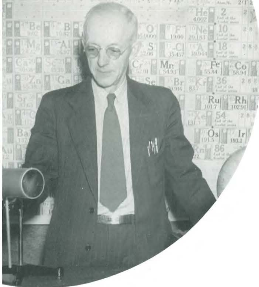
Vice President and Scientist