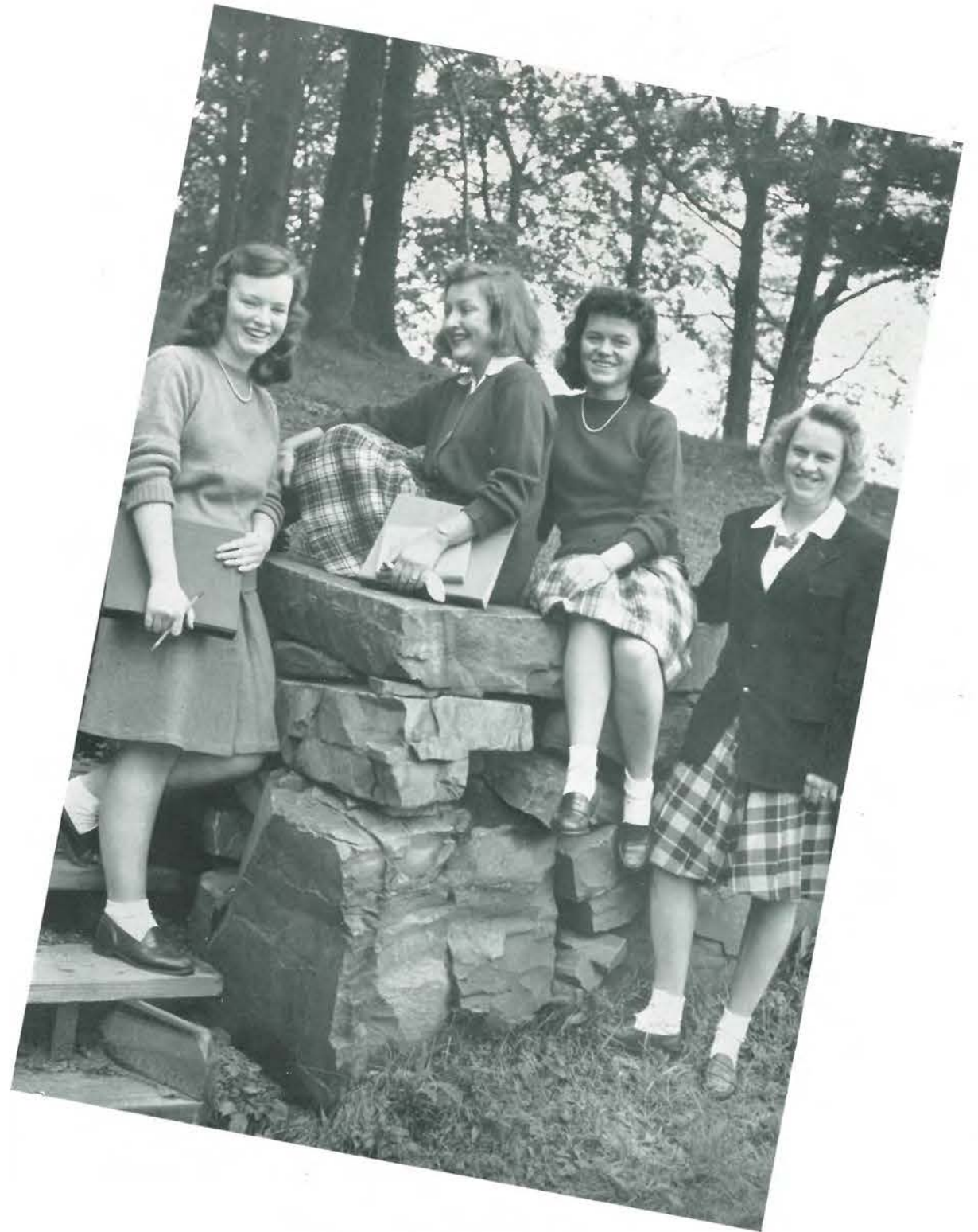
Bunch of Sophs Enjoying Spring Fever