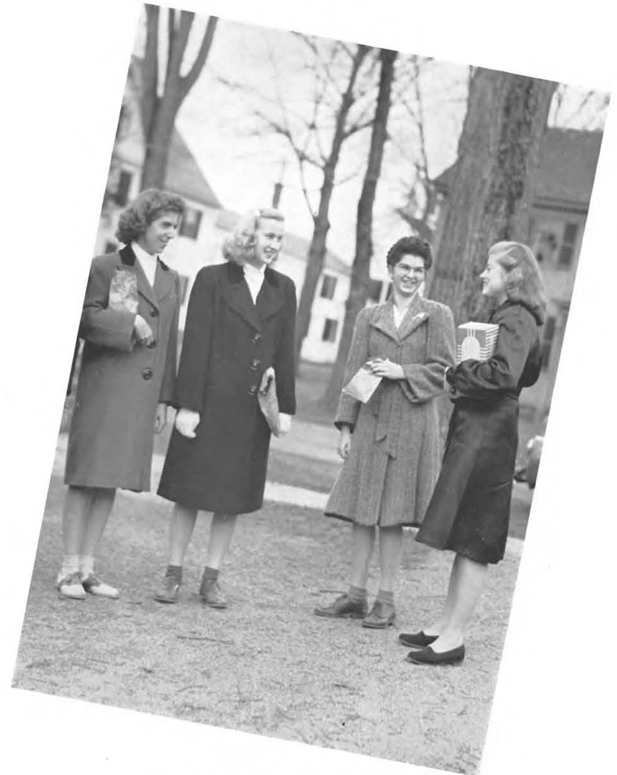
Camera Catches Classmates Returning from Shopping Tour