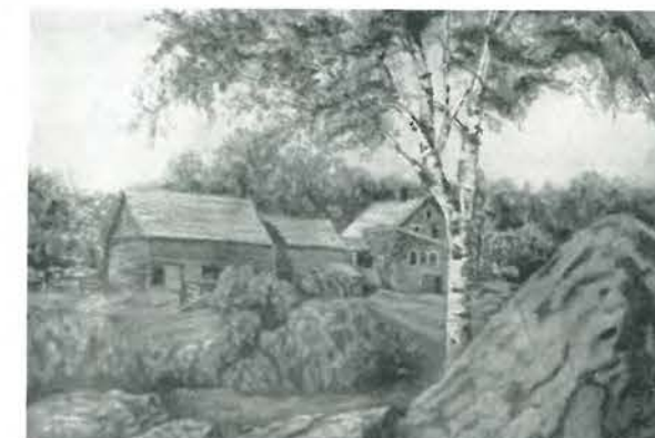
Grass Roots of Maine