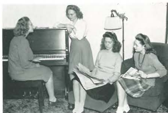
In East Reception Room