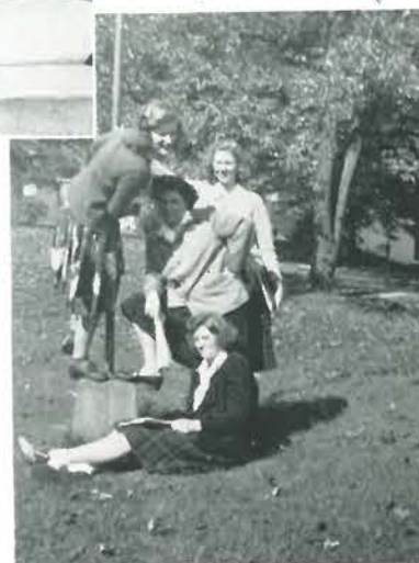
At the Sun Dial