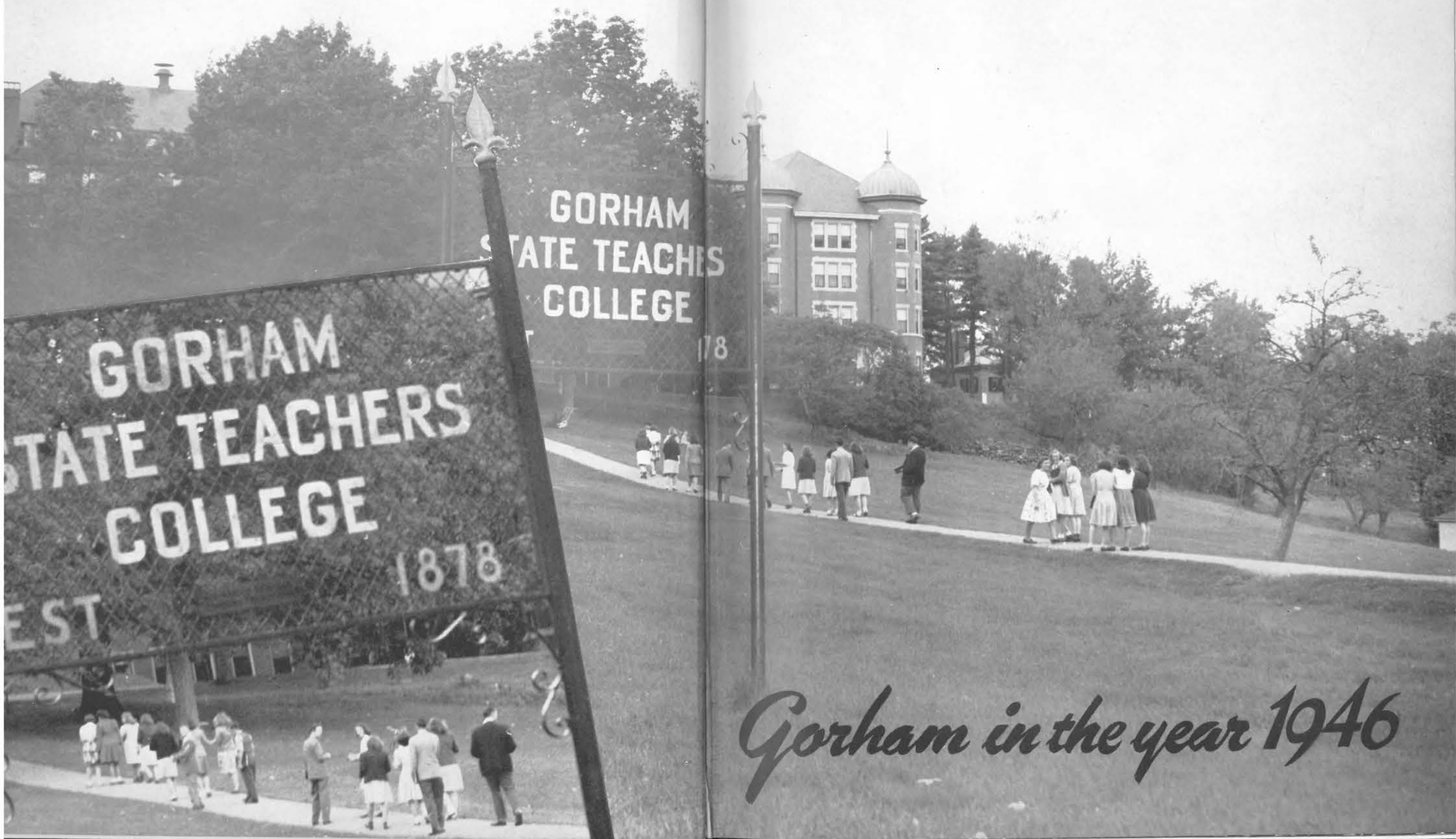
Gorham in the year 1946