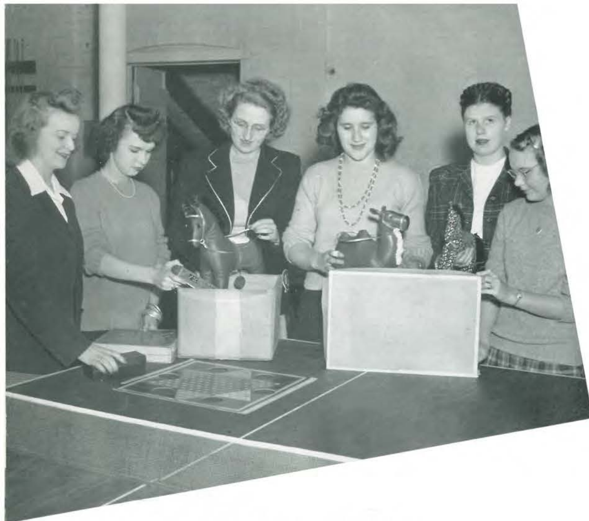
Packing Toys for Portland Orphans