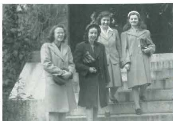
With Sunday Morning Comes Church