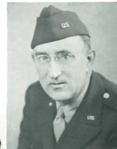
Taught in England