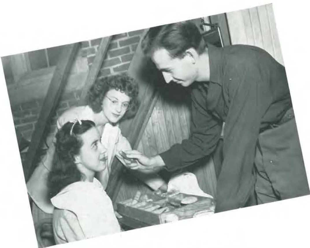
A Little More Lip Rouge Will Do the Trick