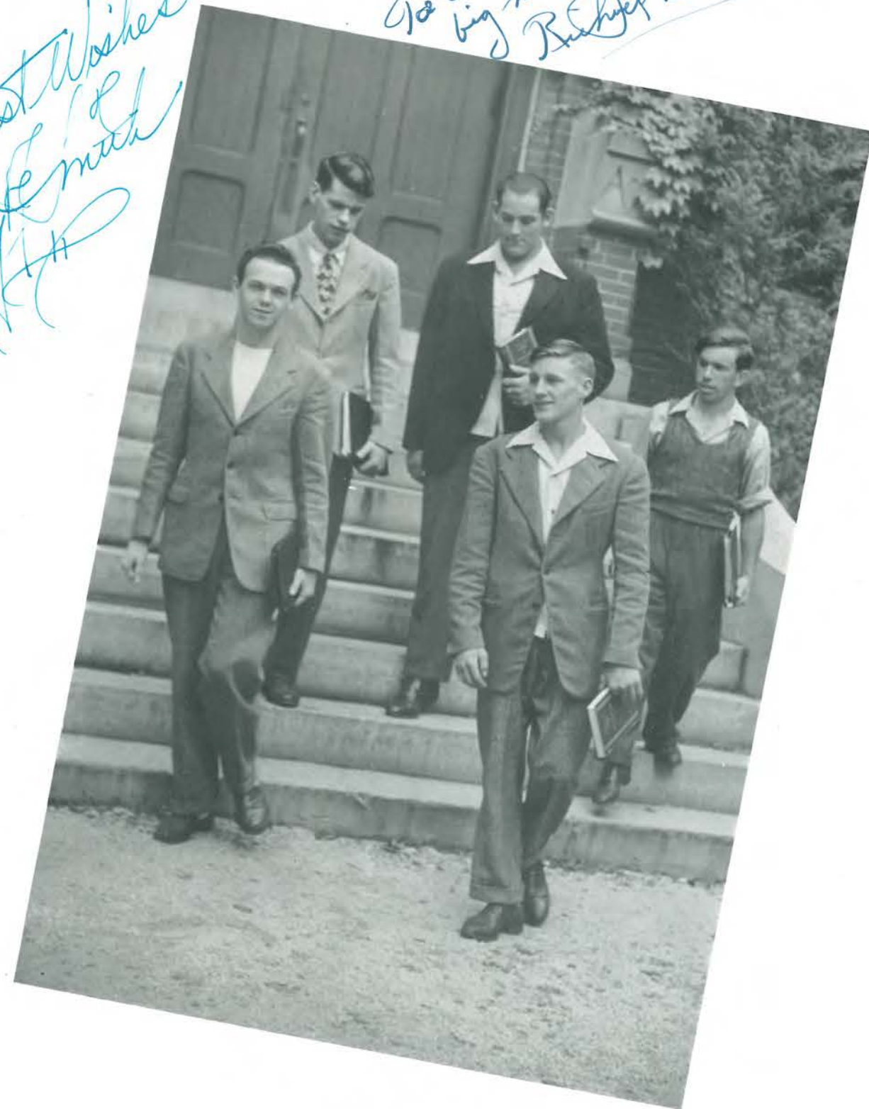
Pride of the Freshman Class

To a Sublime from a big husky 6' 11" 110 Richmond