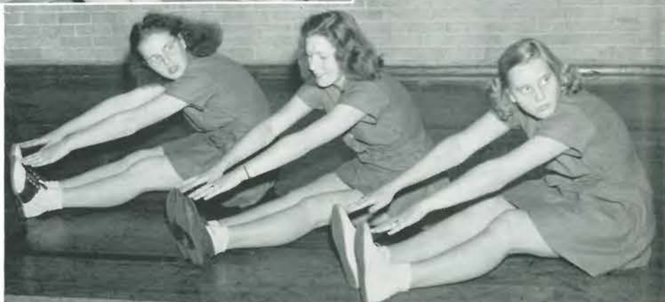
It's All Part of the Secret of a Trim Waistline