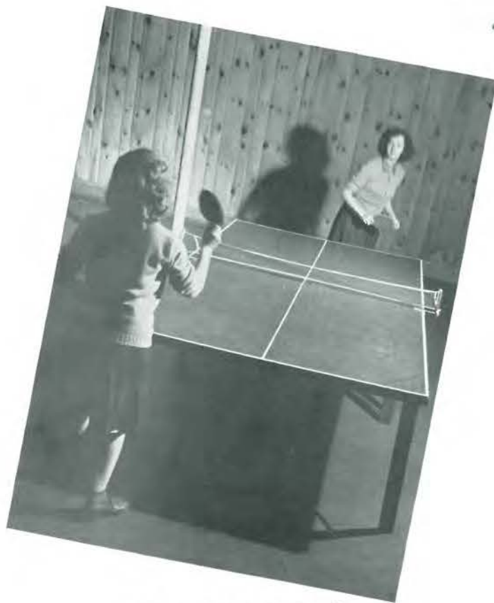
Ping Pong in Robie Rec Room