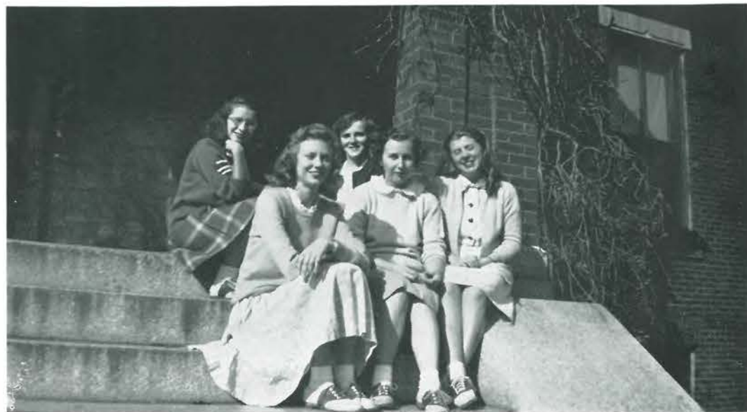
Five Friendly Frisky Freshmen Fabricating Fun