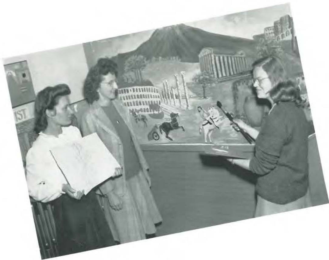
Art Club Enlivens Studio Walls with Mural