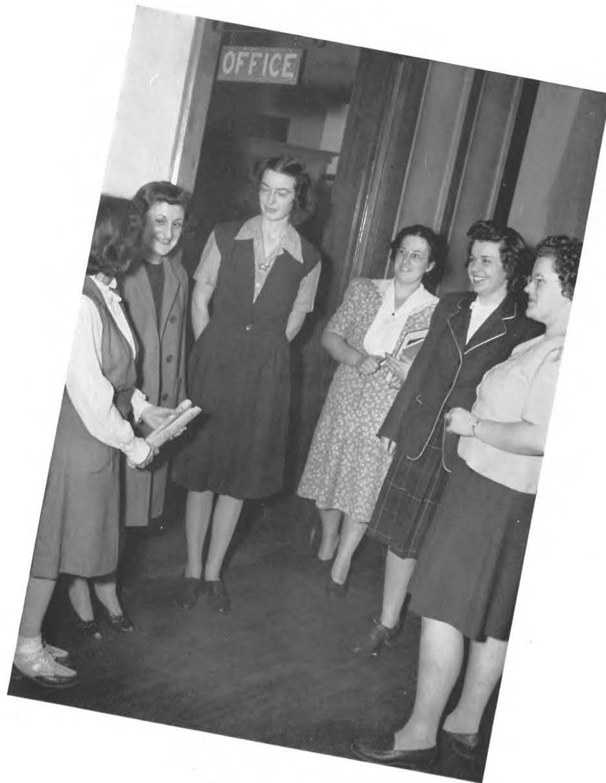
Ex-Teachers Return to Work for Degree