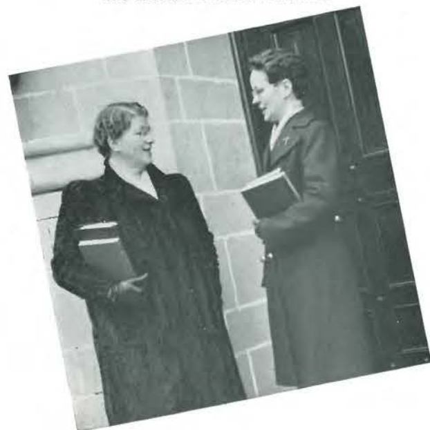
The Home Ec-Music Twosome

Dean of Women B.A., University of Maine M.A., Boston University English, Literature