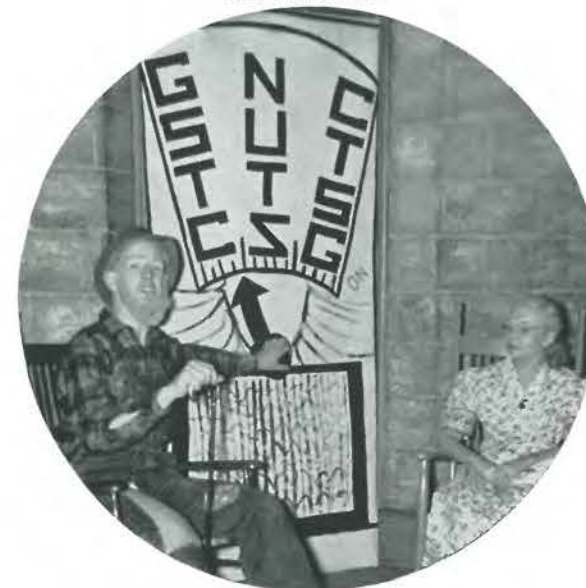
Maw and Paw