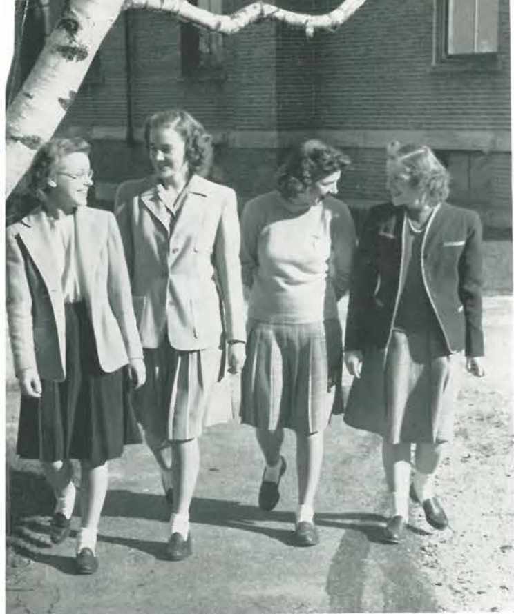
Sophomore Leaders "Strolling Along Together"