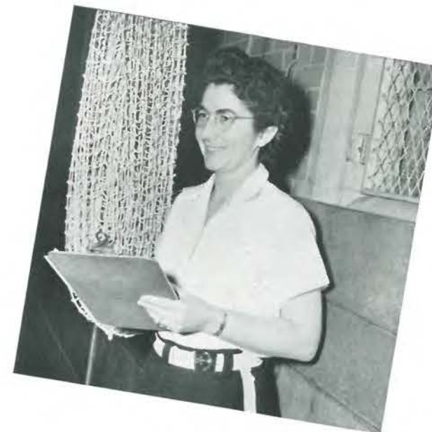
Phys. Ed. Director

Posse-Nissen School of Physical Education B.S., Boston University Graduate study, Boston University Health and Physical Education