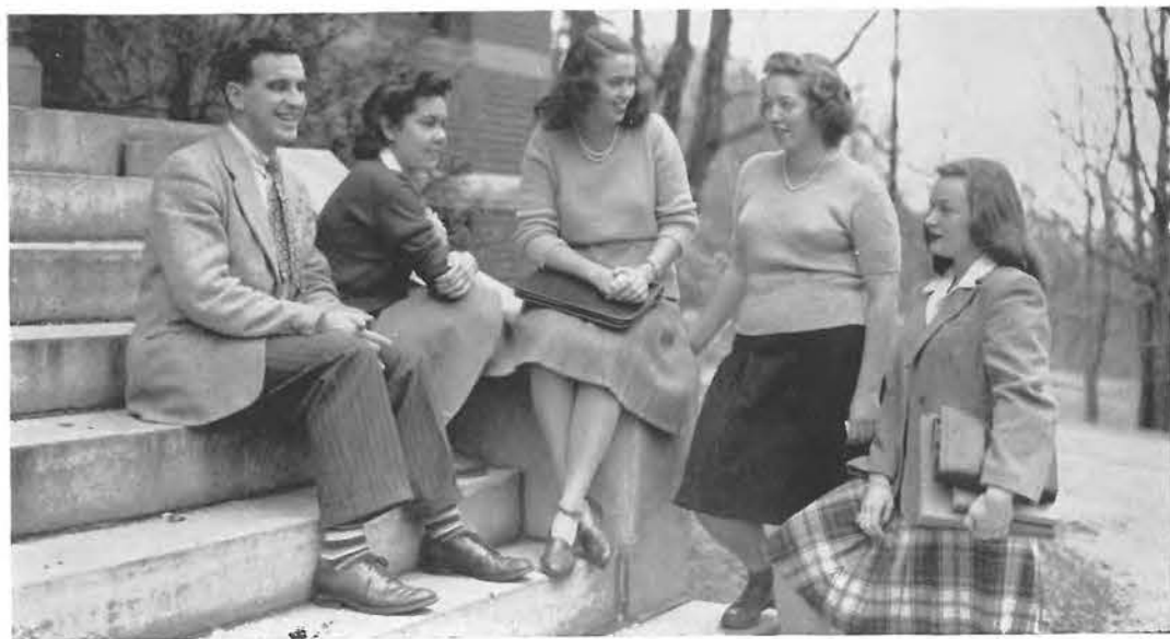
Fourth Year Group Gathers on Corthell Steps Between Classes

As graduation approaches we are eager to try out all the new methods of teaching we have learned here, to try our powers on our own, and we are confident. Teaching is to us a challenge and an opportunity for service.