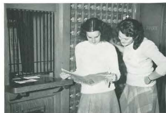
News from Home?