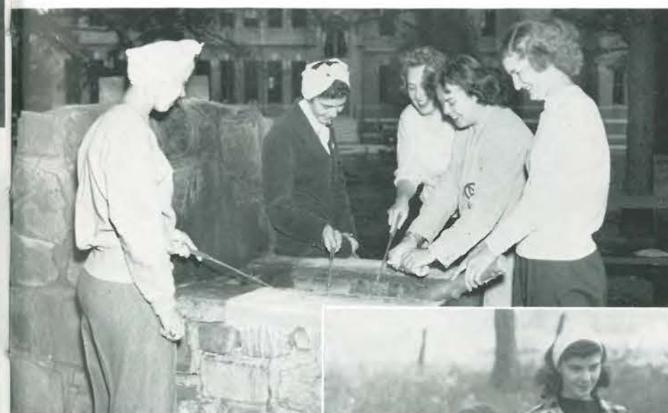
Wienies and Hot Coffee Within Stone's Throw of Corthell

And so the clubs and classes and even the faculty have taken their turns in cooking out in our own grove. These occasions are among our pleasantest memories.