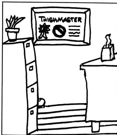
drawing by Naomi Falcone

(Really, when would a columnist who can quote 3 decades of TV plots have had time to get advanced degrees?) So Thighmaster kept happily fielding letters, blithely confident as the months went on that readers were keeping Thighmaster's amateur status in mind.