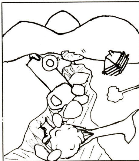
drawing by Naomi Falcone

But, as Thighmaster well knows, the satisfaction of serving humanity cannot