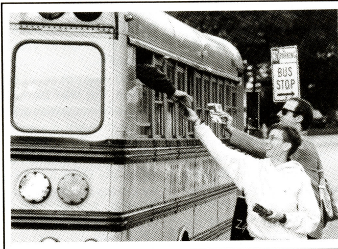
Condom Distribution 101

be expelled for this? See, in Kennebunk High, all literature and materials have to be AUTHORIZED by the school - i.e., the local government - before students can pass them to one another. Sound a little Stalinesque to you? It is. Want to liberate local youth from adults'