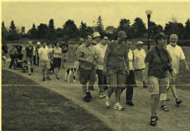
The Portland Walk with the Ones You Love event officially kicked off Pride Week on June 12, 2005.

My summer was spent unpacking boxes of books as we prepared to re-open the CHML. I admit that I spent a couple afternoons reading instead of shelving, but the breadth and depth of the collection was such that many volumes caught my attention. I hope that each of you will get an opportunity to stop by and, perhaps, borrow a book or two.