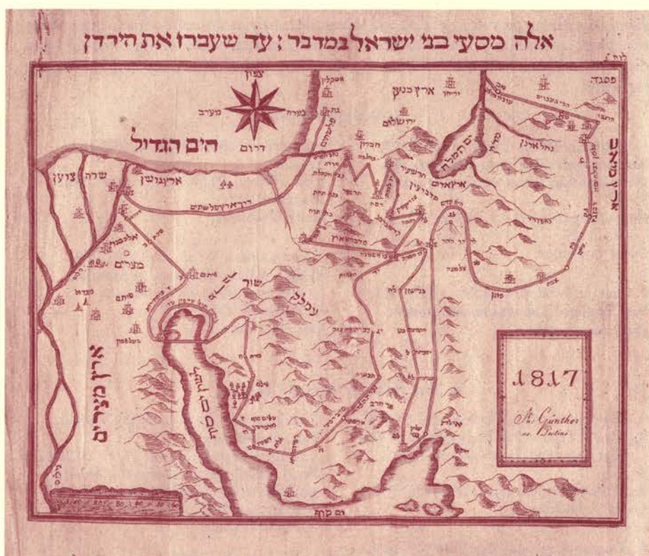
ILLUSTRATION: THE JOURNEYS OF THE ISRAELITES BEFORE THEY PASSED THE JORDAN IN: BE'ER HALUCHOT, EXPLANATION OF THE PLATES, OFEN, 1817