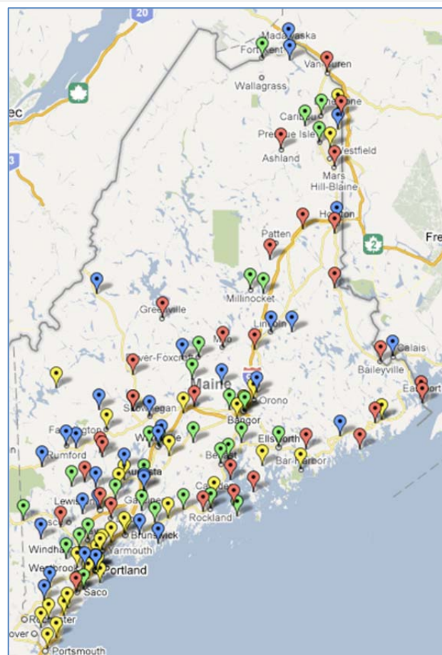
Figure 3: Likelihood of 9 th Grader (2006-2007) Graduating in Four Years and being Proficient in Both Mathematics and Reading

Key: ■ <21.2% ■ >21.2%-<27% ■ >27%-<34% ■ >34%