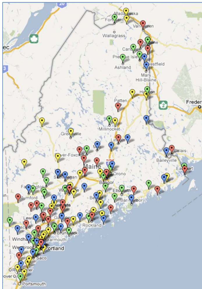
Figure 1: Maine High School Graduation Rates 2010

Key: ■ 65.6%-<77.8% ■ 77.8%-<83.5% ■ 83.5%-<90.6% ■ >90.6%