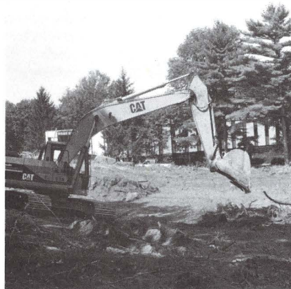
Crews clear land to make way for a new roadway and parking associated with the Gorham field house.