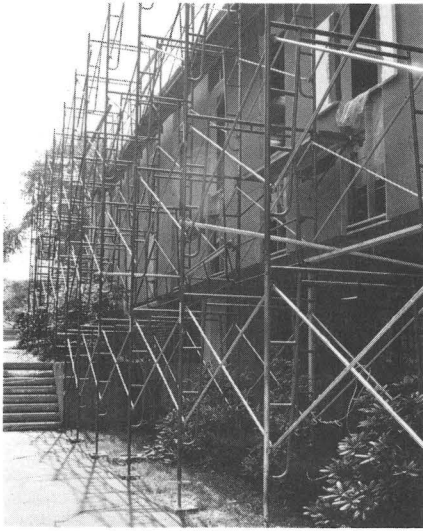
Upgrades to the exterior facings and classrooms at the Mitchell Technology Center are just some of the improvements on campus over the summer.