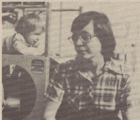
from Choosing Children , see Jan. 18

Cambridge — "Choosing Children," a film on lesbians becoming parents. Angry Arts Film Series, YWCA, 7 Temple St. 7:30PM. $2.75 donation. Also on Sat. and Sun. Info: 524-2915.