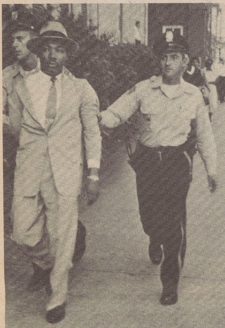
Martin Luther King, Jr., see Jan. 13

Boston — The Black Men's Association of Boston forum with the Patterson Chorale presenting a Gospel Musical Birthday Tribute to honor Dr. Martin Luther King. 558 Mass. Ave. 5PM. Info: 353-0719 or 782-0408.