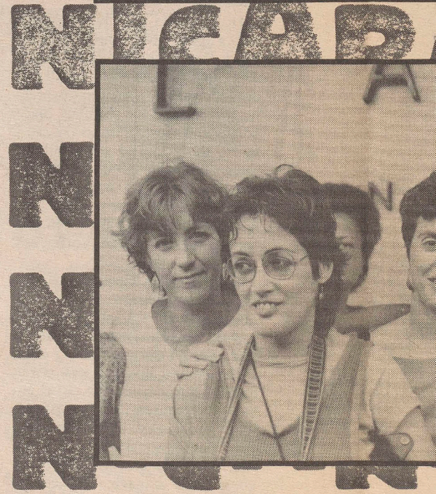
members of the Somos Hermanas delegation