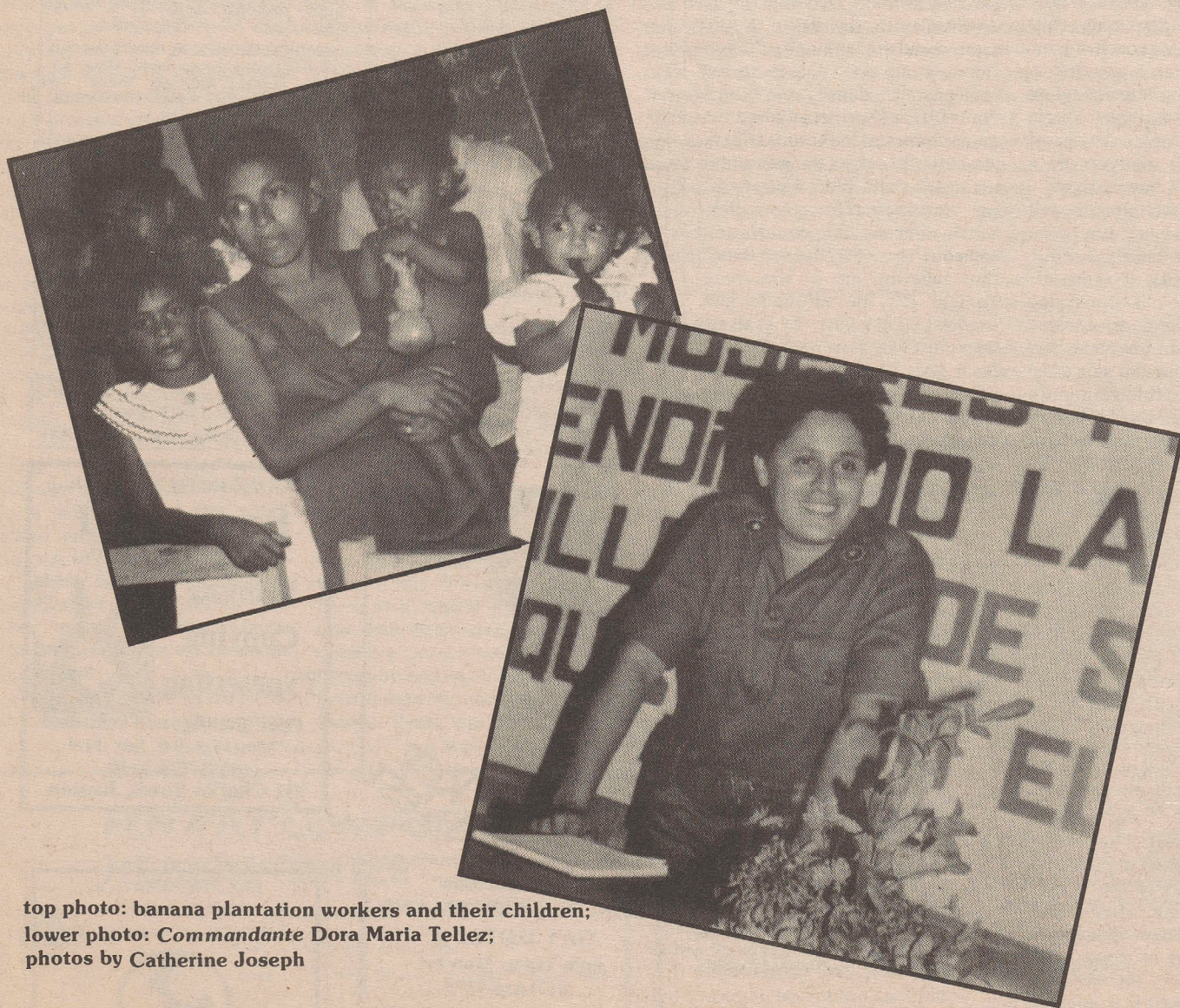
top photo: banana plantation workers and their children; lower photo: Commandante Dora Maria Tellez