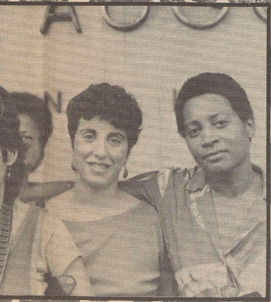
Manas delegation