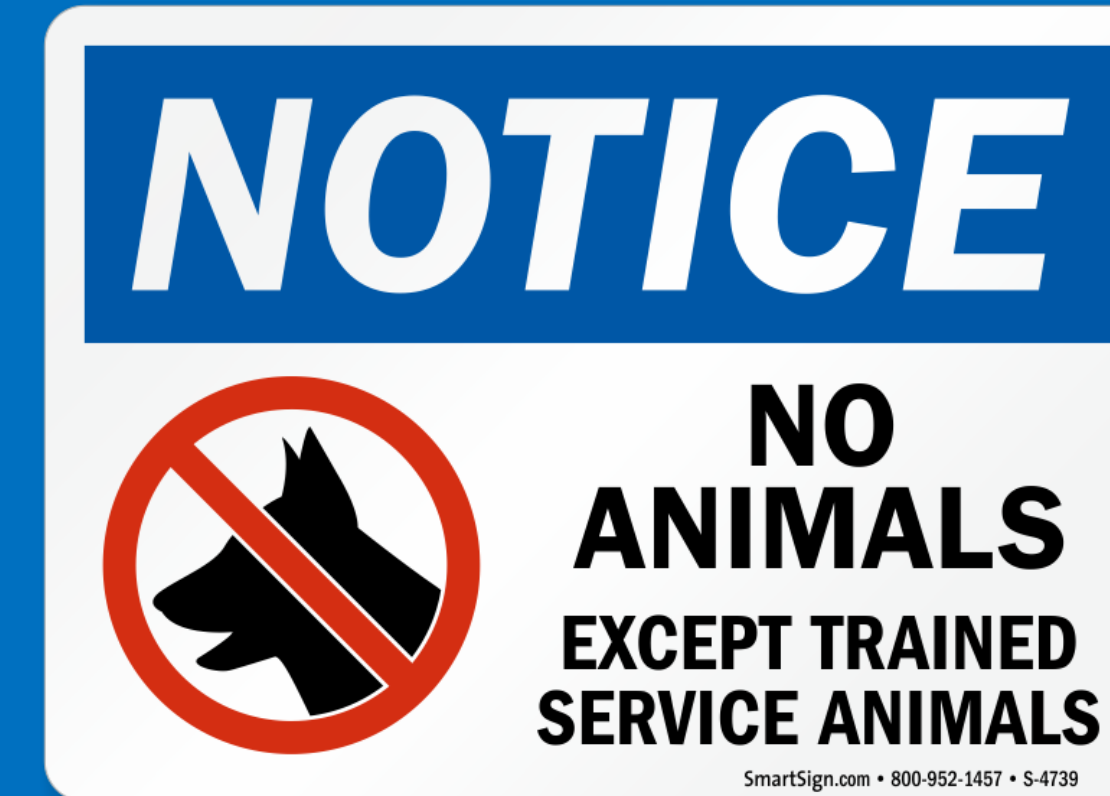
Figure 1. Service Dogs Welcome