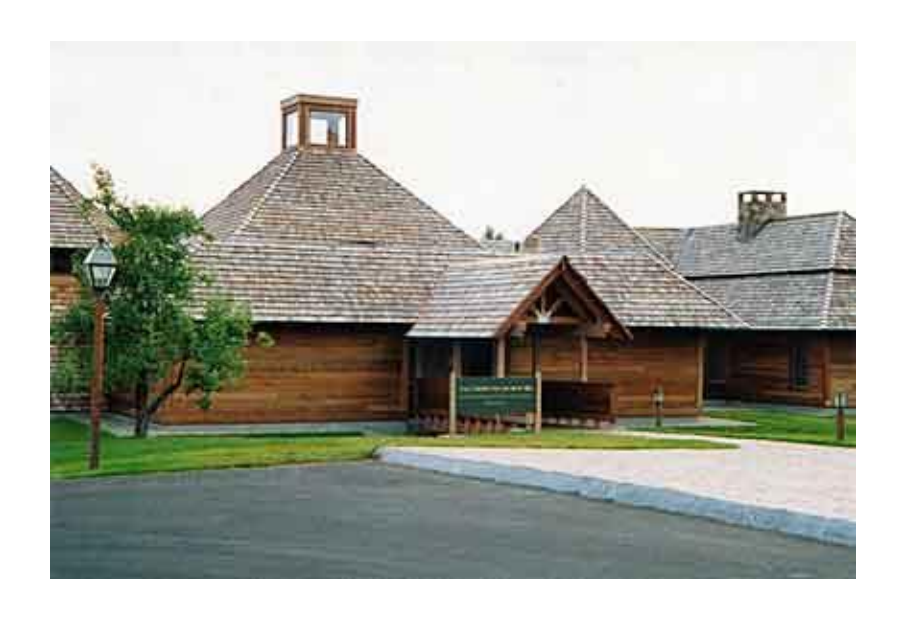
National Yiddish Book Center Tour Sunday, May 7, 8AM-8PM