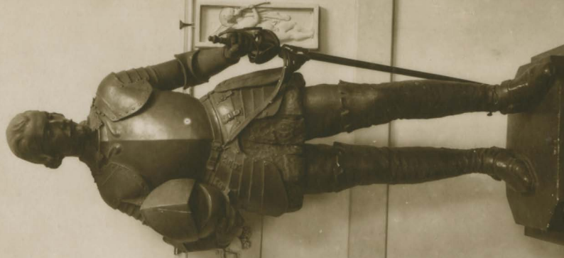
SHREWSBURY SCHOOL, "SIR PHILIP SIDNEY"