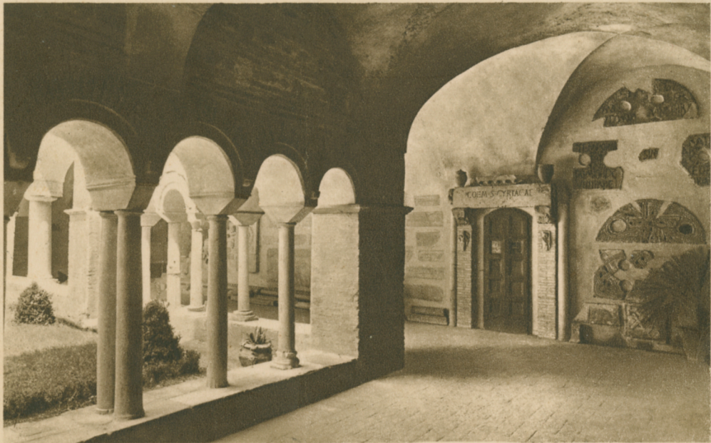
Peristilio del Chiostro e nuovo ingresso alle Catacombe di S. Ciriaca - Restauro 1929