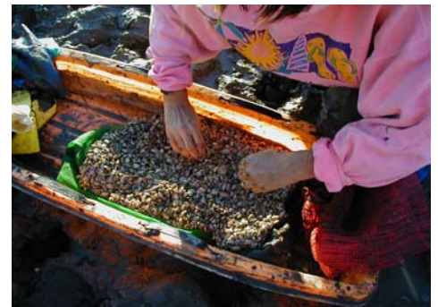
In 2001, CBEP led an effort to test the value of softshell clam farming options by seeding clams in three saltwater "farm" locations along the Bay.