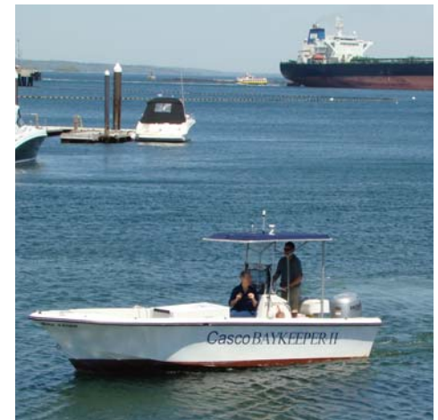
CBEP supports Friends of Casco Bay's Mobile Pumpout Program, which helps recreational boaters comply with Maine's Pumpout Law.