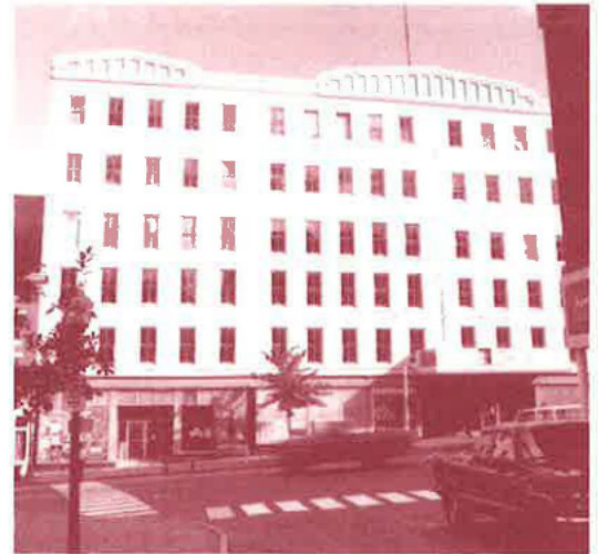
Freese Building, Bangor

Lakari noted that, while most projects need local approval before moving ahead, all of the developments offer something beyond low income housing. The Bangor development, for example, completes revitalization of a downtown building and a portion of the downtown area. It also will provide assisted living services to residents, if the project is successful in getting an upcoming Request for Proposals from the Department of Human Services.