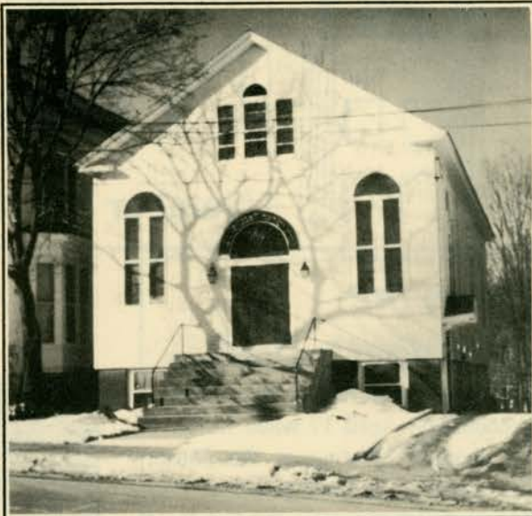
The exterior of the Beth Israel Synagogue.