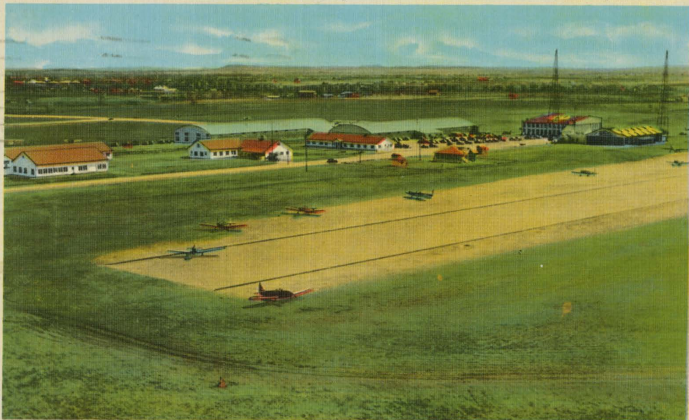
Muskogee Division of Spartan School of Aeronautics, Inc., Muskogee, Okla.