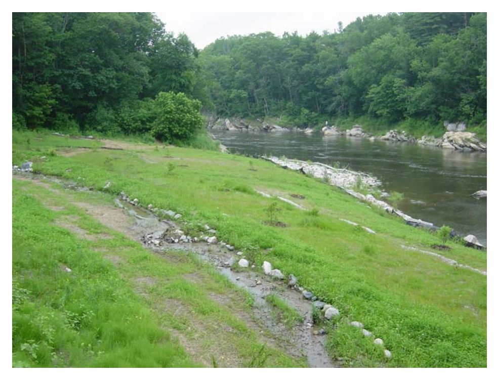
\label{eq:continuous} \textbf{June 29, 2006. Site post-Phase II implementation. Note granite wall to the left, which was unearthed during Phase I regrading activities.}