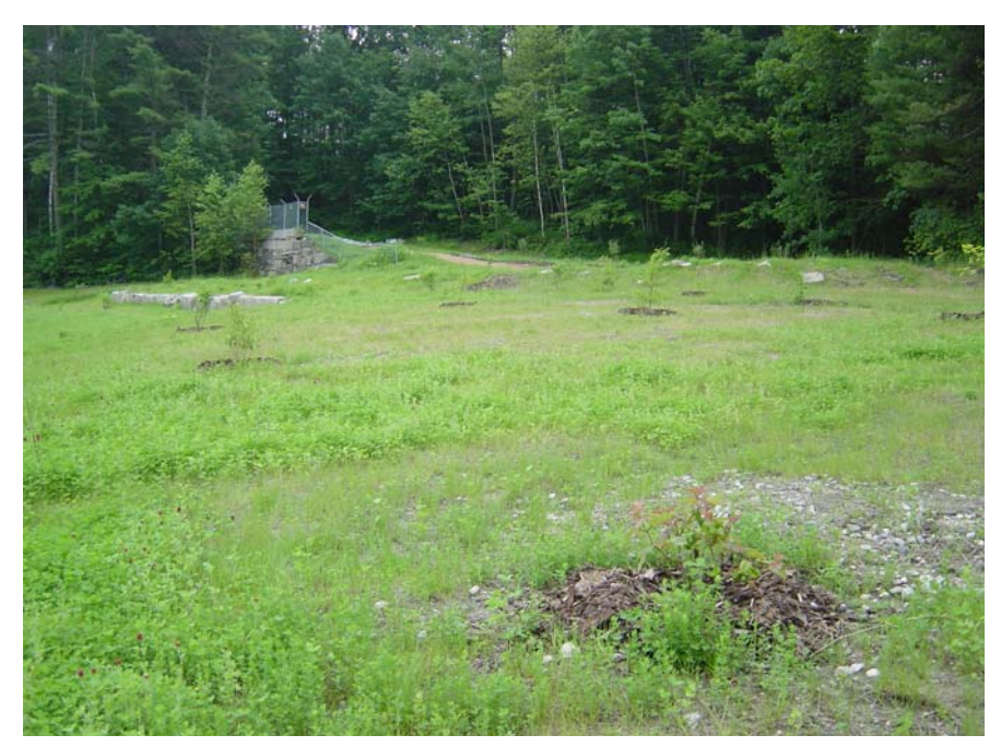
\label{eq:continuous} \textbf{June 29, 2006. Site post-Phase II implementation. Note granite wall to the left, which was unearthed during Phase I regrading activities.}