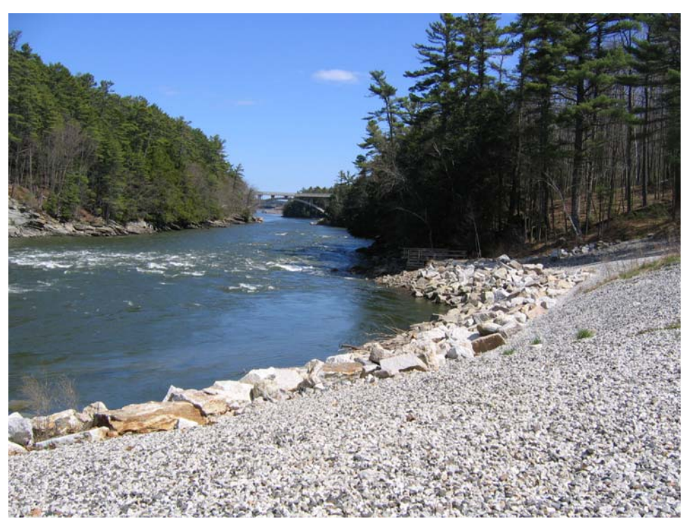
May 2005. Presumpscot River southern shore facing downstream at site of Smelt Hill dam removal.