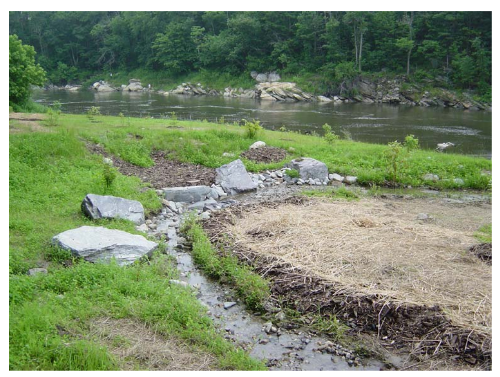
June 2006. Swale after Phase II adaptive management. Hayed area will be reseeded by Presumpscot Youth Conservation Corps the second week of July.