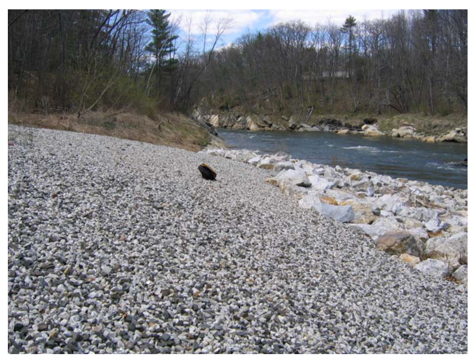
June 29, 2006. Site post- Phase II implementation. Note granite wall to the left, which was unearthed during Phase I regrading activities.