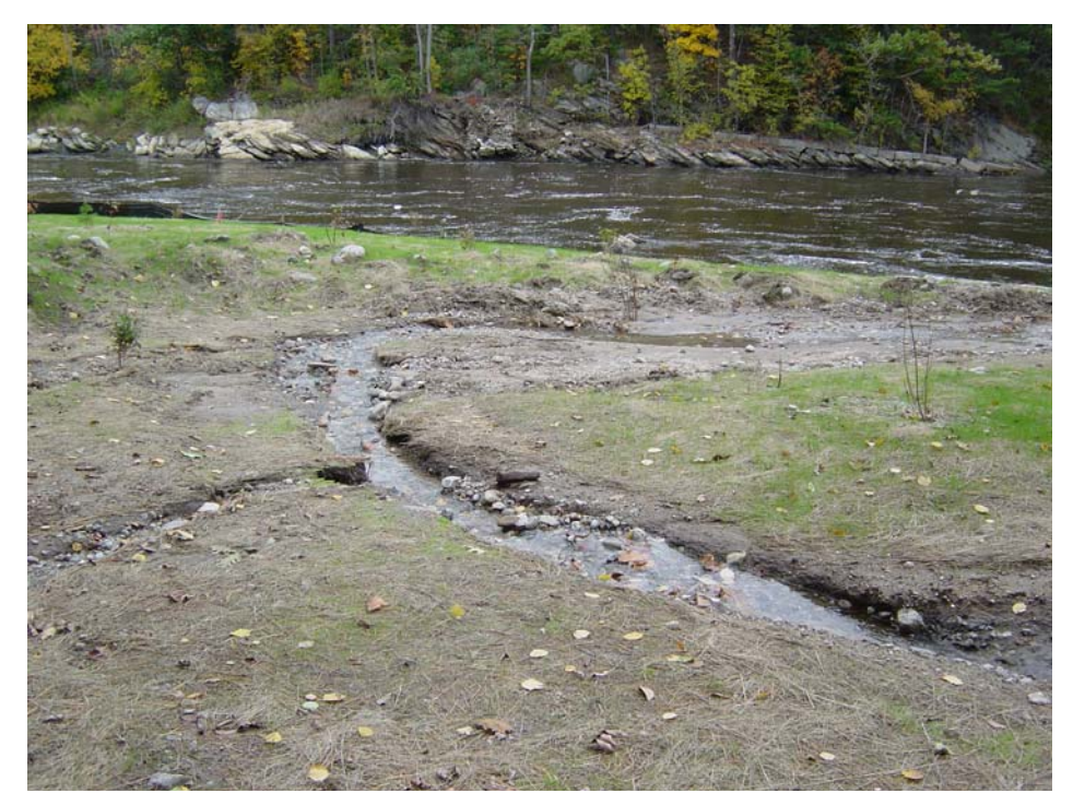
Fall\ 2005.\ Grassed\ swale\ following\ October\ rain\ events.