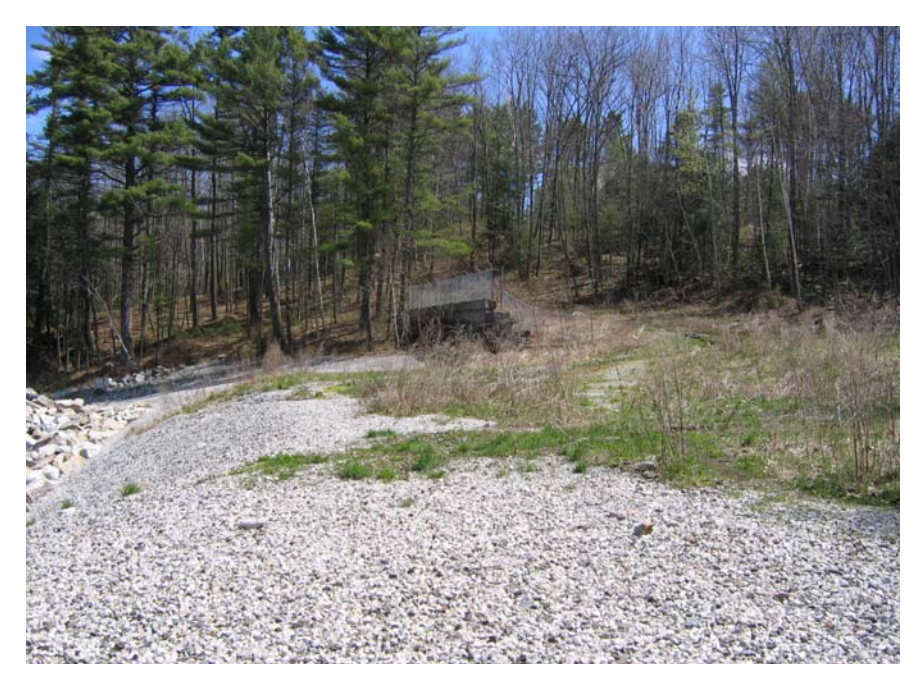
April 2005. The site pre-project implementation.