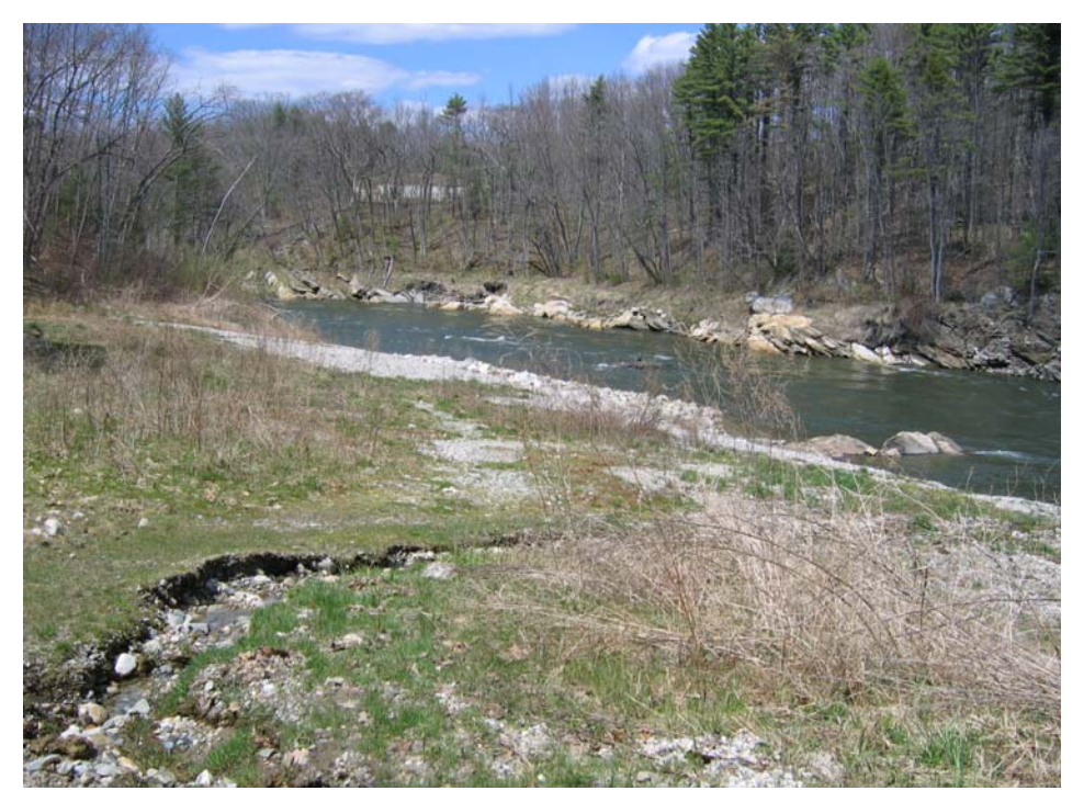
April 2005. Original stormwater runoff channel pre project implementation.