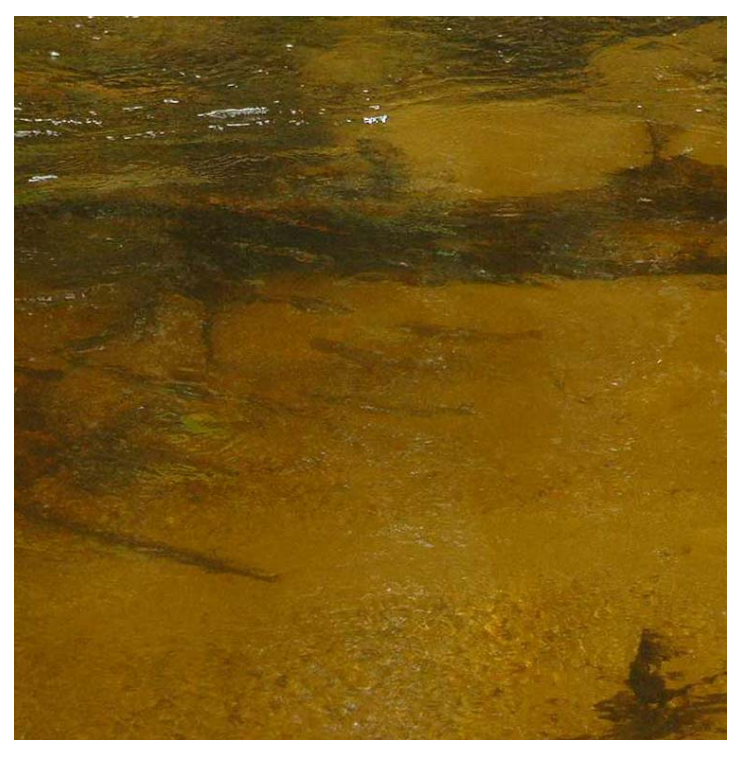
Alewives below a debris jam near Rte 302 -- 5/31/03