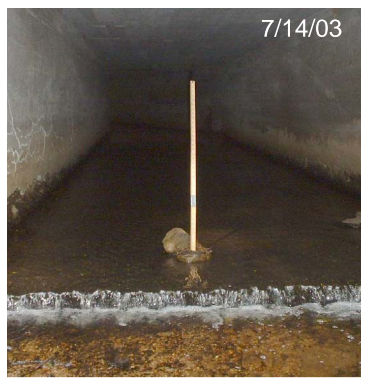
Shallow water (at certain times of year) and flat, concrete bottom.