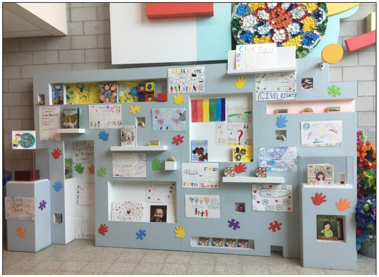
The Falmouth Elementary School civil rights team's art installation