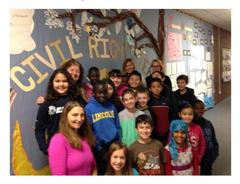
The Mentoring Group from Riverton's civil rights team reads Black Is Brown Is Tan to kindergarten students.