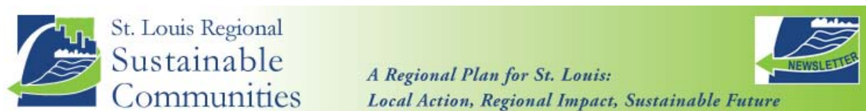
Figure 13. St. Louis Regional Sustainable Communities logo

PlanET employs a creative and highly interactive method of fulfilling the capacity building requirement. Extensive use of their web platform supports this project’s easily accessible educational and knowledge sharing initiative.