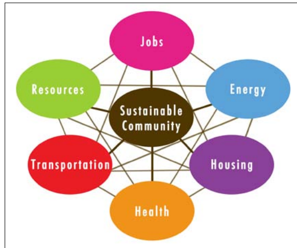
Figure 8. GrowNC's livability framework

professionals and other stakeholders. These groups are self-selected by involved stakeholders based on their respective expertise and interests and operate as GrowNC's primary method in producing cross-cutting knowledge for analysis and future collaboration between groups. The process of establishing a baseline of information involves three rounds of work with the GrowNC project team. First, the work groups synthesize information presented by the project team to identify issues and opportunities. Second, working sessions attempt to generate ideas and alternative solutions based on public feedback gathered at a large meeting called a Reality Check. Third, work groups will start to frame the policies and implementation plans for the overall project. By involving consortium members at all levels of this project's governance (consortium, steering committee and working groups) GrowNC is effectively trying to maximize the interaction and opportunities stakeholders will have to learn from each other.