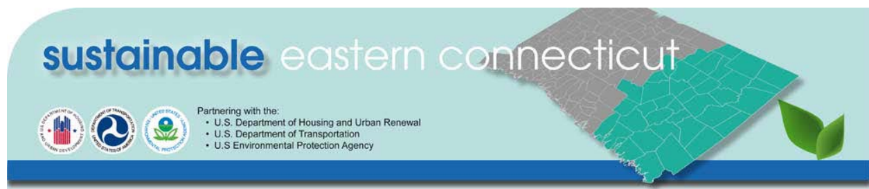
Figure 1. Sustainable Eastern Connecticut logo

were regions with existing plans that integrate the principles for regional sustainability and aim to develop a detailed plan for implementation. As indicated in each section, the first eight grantees discussed will be Category One applicants, while the last two will be Category Two. The focus on Category One applicants has two purposes: (1) to keep the information provided in the paper focused on agencies looking for innovative ideas rather than pre-established plans and (2) to act as a comparison to the Sustain Southern Maine project resulting from the Greater Portland Council of Governments being a 2010 Category One grantee of the SCRPG program. All information, descriptions and graphics in the following section are drawn from each program’s website unless otherwise indicated.