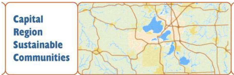
Figure 15. Capital Region Sustainable Communities logo

As mentioned, the ECOS project is a Category Two grantee in the SCRPG program. Therefore, the majority of their capacity building and knowledge sharing work reflects the need to create a common understanding among the involved municipalities so that each may update their respective comprehensive plans to align with the project’s overall goal and vision, which are aimed at implementation. While ECOS does a suitable job of creating opportunities to share expertise across their focus areas and between stakeholders, due to the fact this effort is not starting from scratch there are little observable activities aside from participation in the meetings and allowing comments and dialogue on associated report drafts. That being said, it appears that this project will in the future be opening up roundtable discussions as well as conducting site visits and field events in order to create a more interactive knowledge sharing process.