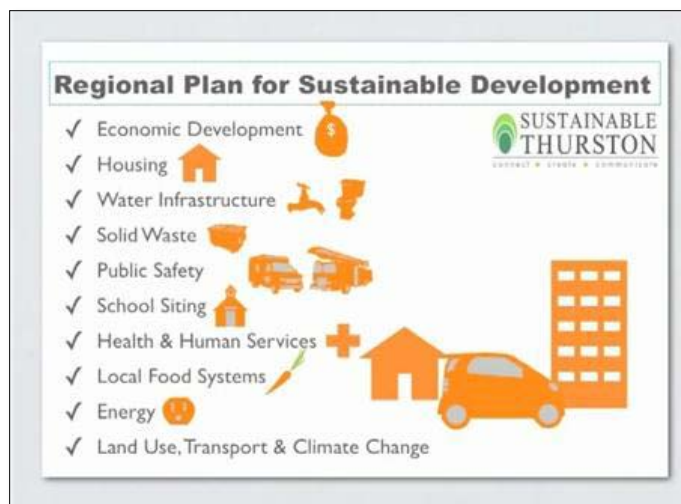
Figure 6. Sustainable Thurston’s ten areas of regional development

Sustainable Thurston represents a diverse assortment of partners in a regional collaboration to understand and make connections between economic, social and environmental issues. There are twenty-nine partners representing local governmental jurisdictions, state agencies, organizations and community groups that make up the project’s task force. Informed by a series of expert panels charged with developing recommendations and background information to identify challenges, opportunities and linkages between regional issues, the task force is also responsible for creating a dialogue with the public regarding the project’s overall ambitions. Sustainable Thurston focuses on ten areas of regional development (see Figure 6). Additionally, given an anticipated increase in population of 170,000 people over the next thirty years, this project has begun at a pivotal time in order for the region to determine and accommodate what responsible, sustainable growth and development will look like.