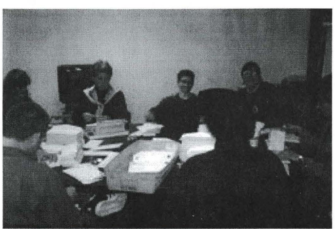
Volunteers are the heart and soul of MLGPA's activities. Here a group stuffs envelopes for a recent fundraising mailing.

Two years ago Maine was to become the first state in the nation to launch a pioneering new program that included a federal waiver to pay for early medical care for about 300 people with HIV who were ineligible for Medicaid because of their incomes.