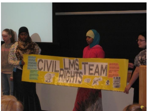
Students reading? It's reader's theater from the civil rights team at Carrie Ricker Middle School.