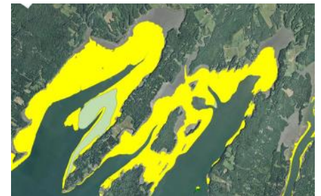
This map of Middle and Maquoit Bays shows historic eelgrass beds in yellow and current eelgrass beds in light green, showing huge losses

Protecting and restoring the ecological integrity of the Casco Bay watershed