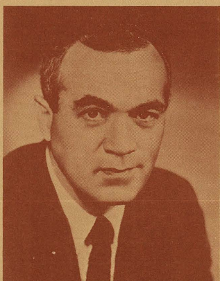
DECEMBER 6 MARTIN AGRONSKY — Washington correspondent for CBS Radio-TV, winner of DuPont and Peabody Awards, lectures on "The U. S. in a Changing World."