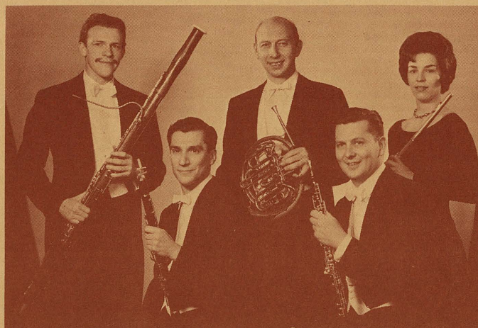
FEBRUARY 8 FINE ARTS WOODWIND QUINTET — Five Boston woodwind artists, principals in the Cambridge Festival Orchestra, in concert.

In addition to the Concert-Lecture Series, a program of student performances is presented on the campus in Russell Hall auditorium at 8 o'clock in the evening. Seating is limited and the public admission is $1.00 for each performance. Reservations may be made through the College Ticket Desk.