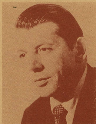
OCTOBER 26 JOHN CIARDI — Poetry editor of Saturday Review , English professor, television personality, lectures on "What Good is a College?"

All programs are at 8 o'clock in the evening in Russell Hall Auditorium. Seating is limited and the public admission is $1.00 for each program. Reservations may be made through the College Ticket Desk.