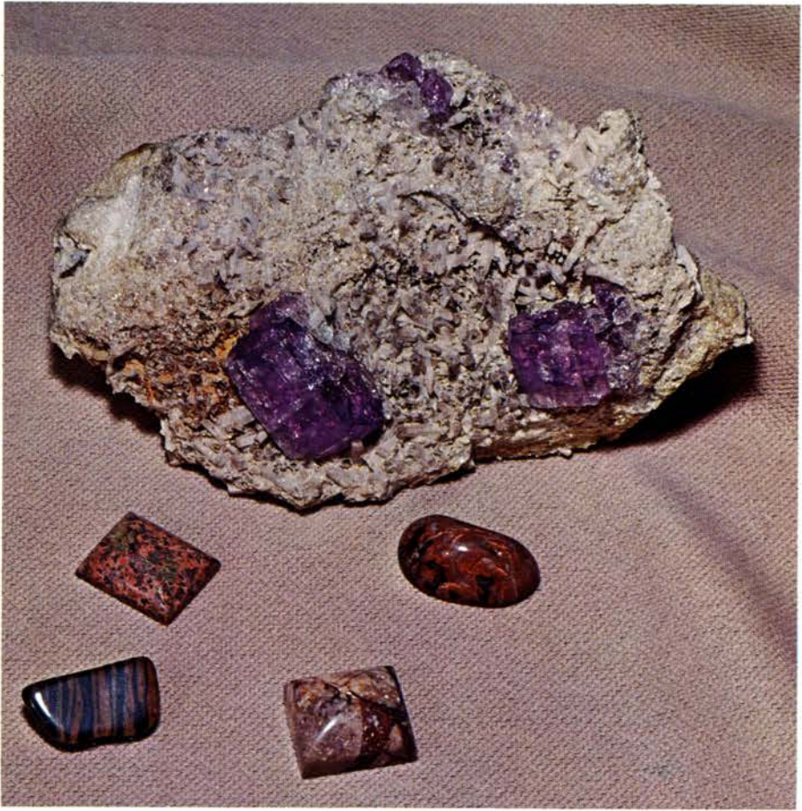
The specimens illustrated here include crystals of purple apatite in pegmatite matrix (background) collected at Mount Apatite in Auburn, from the collection of the Harvard University Mineralogical Museum; and (foreground) specimens of polished agate and granite from various Washington County localities, from a private collection.