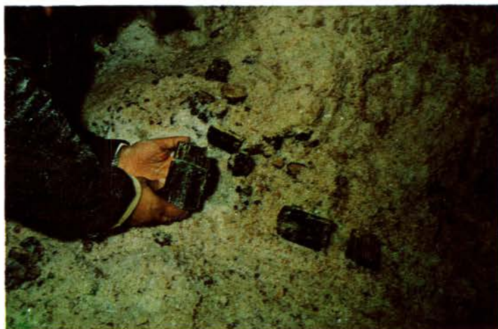
The interior of a large gem pocket, discovered at Newry in 1972, is shown here. Dark crystals of green tourmaline contrast sharply with the light-colored quartz and feldspar (cleavelandite) "pocket gravel".

The Maine State Museum is proud to have assembled an unprecedented exhibition of outstanding "Maine Gems and Gem Minerals" drawn from the inventories of leading collections throughout the United States and in Europe. It is our hope that these specimens, many of which have never before been displayed in the State, will help to convey Maine's sense of pride in the rich heritage of this land that is ours.