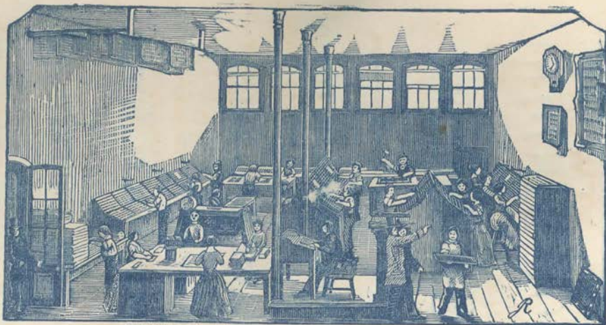
THURSTON'S COMPOSING ROOM.

The Largest Printing Office in this State, and supplied with all the Materials for Book, Pamphlet and Job Work. THURSTON'S, FOX-BLOCK, 82 EXCHANGE ST., PORTLAND.