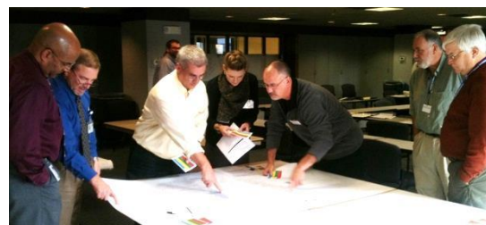
With vulnerable areas mapped, community leaders can make informed decisions about populations and property most in need of mitigation measures.