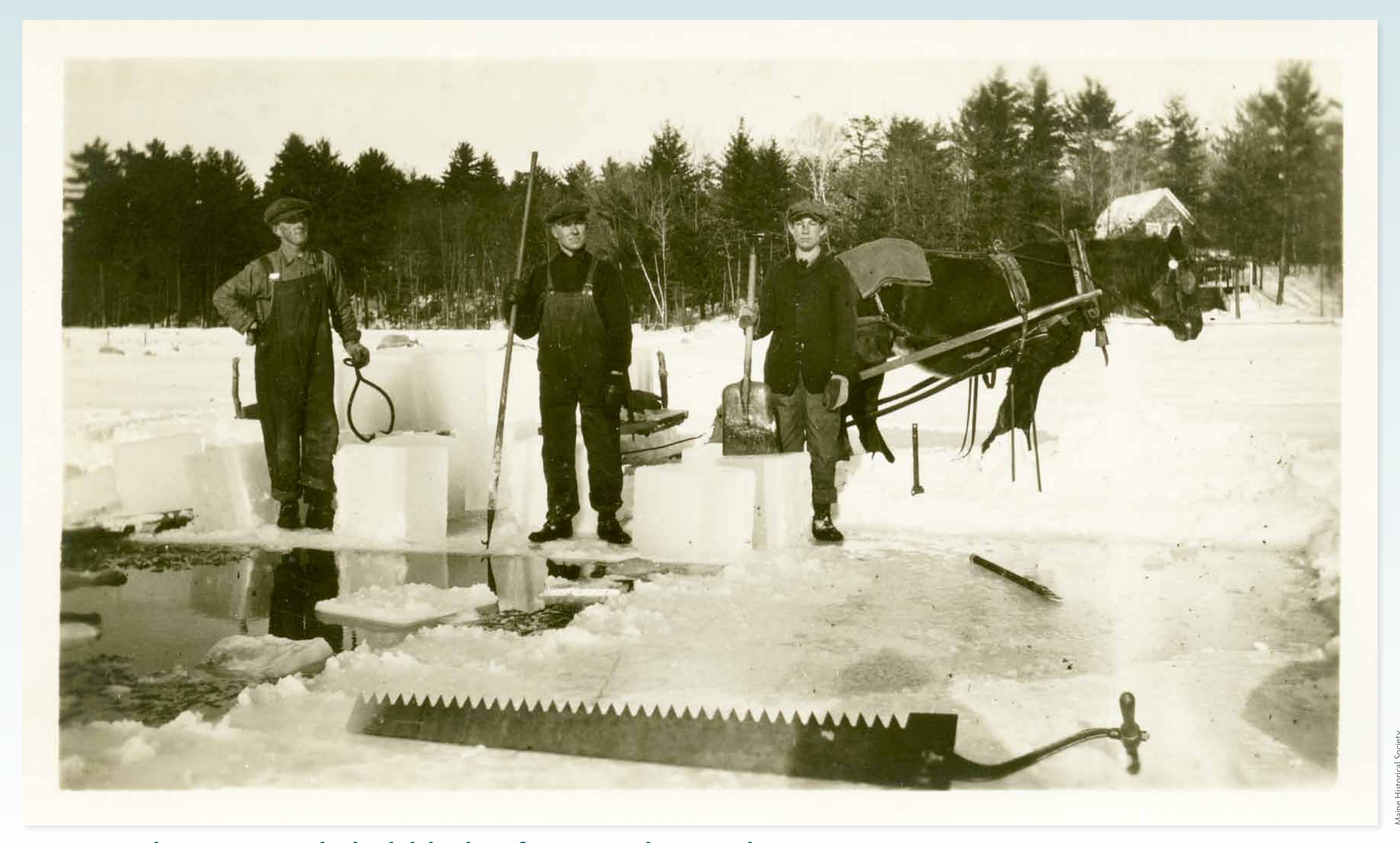
Three workers pose with thick blocks of ice on Sebago Lake circa 1920.