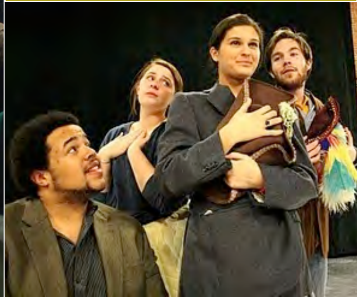
Photo on bottom: Actors in the Theatre Department's spring student production, Triumph of Love .