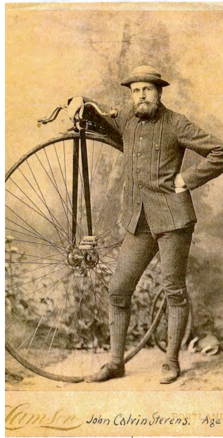
John Calvin Stevens with his bicycle, age 27.