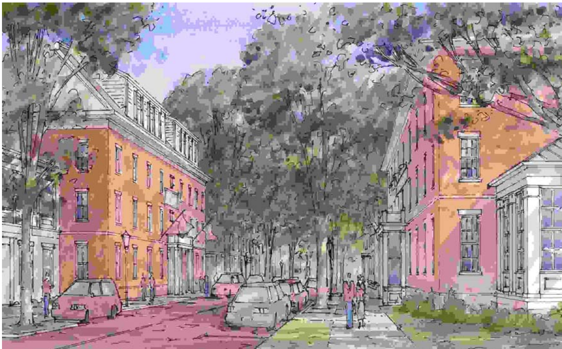
Dover-Kohl, Inc. Smart Growth Rendering of BNAS Reuse

The Planning Process. In developing the reuse plan, the BLRA thought it important to understand and respond to a “variety of existing market and economic trends, local community issues and policies, physical conditions and characteristics, and environmental conditions of the property”. 12