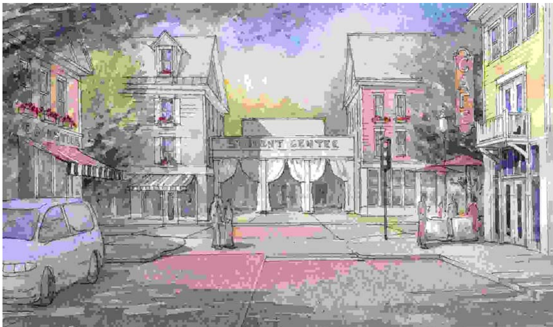
Dover-Kohl, Inc. Smart Growth Rendering of BNAS Reuse