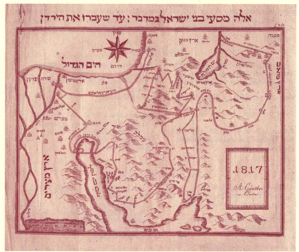
ILLUSTRATION: THE JOURNEYS OF THE ISRAELITES BEFORE THEY PASSED THE JORDAN IN: BE'ER HALUCHOT, EXPLANATION OF THE PLATES, OFEN, 1817